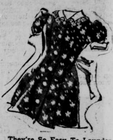
They're So Easy To Launder

that wear so well. Bright cot-tons, flowered or solid colors,, in that wear so well.