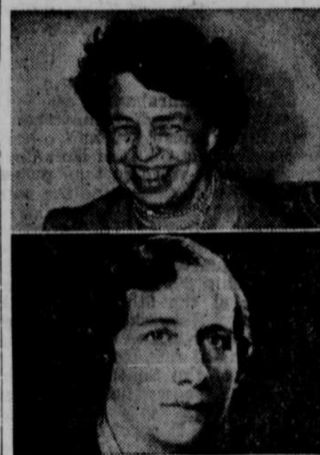
Mrs. Franklin D. Roosevelt, upper; and Mrs. Harry S. Truman, wife of the newly elected vice president of the United States. Unlike the first lady of the land, Mrs. Truman takes little part in politics or in public life activities. Mrs. F.D.R. says she is ready for new term.