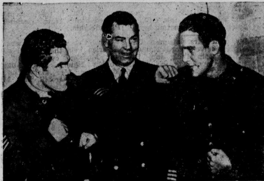
Commander Jack Dempsey of the U. S. coast guard, center, gives the nod to Corp. Billy Conn of the U. S. army air service command, right, as he squares off with light heavyweight champion of England, Sergt. Freddie Mills. According to Dempsey, "The only thing Mills has on Conn is an extra stripe."