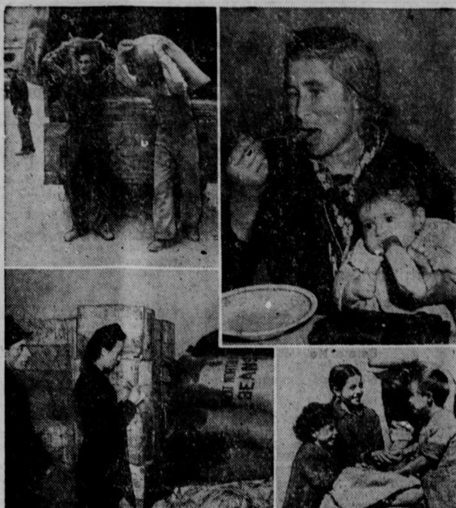
An old Italian farmer joyfully shows children one of the sacks of wheat that have been shipped to Italy by Allied government (right). The woman and baby, refugees from St. Nazaire, France, receive their share of food. Left, shows the unloading and checking of food in Italy, intended for the civilian population.