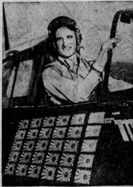
Commander David McCampbell of Los Angeles, Calif., showing the 30 "Meatballs" on his plane, each representing one Japanese plane shot down from the air.