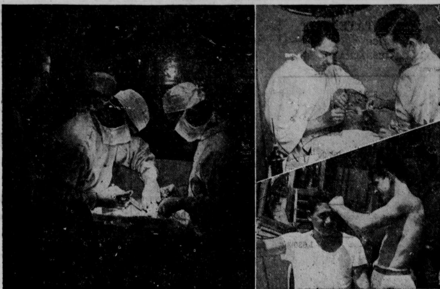
Aircraft naval doctor (left) performs emergency appendicitis operation on young fighter pilot at sea. On board ship and ashore, the Gobs receive the best of dental care. Upper right shows a naval dentist and assistant eliminating a sailor's toothache, while lower right shows one of Uncle Sam's fighting tars getting a close trim at sea. The grinning seaman belongs to crew of submarine patrol.