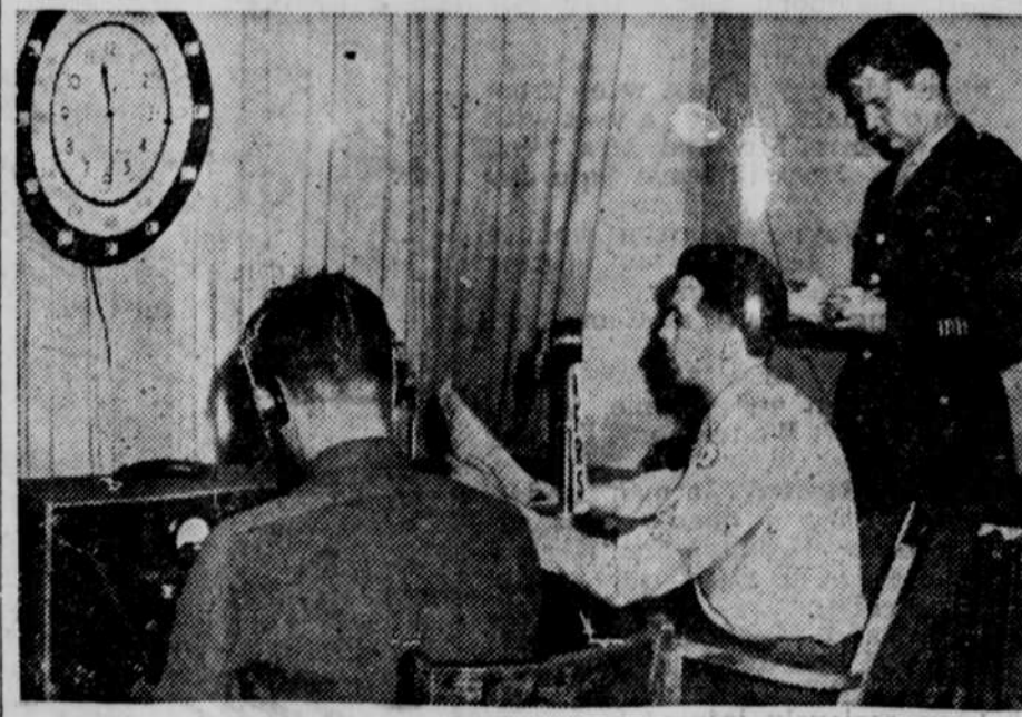
GIs of the American news services broadcast election returns to American soldiers all over the world from the New York headquarters of Yank magazine. The army news services shooting the result overseas with an estimated 25,000 words by cable and another 25,000 by radio to furnish the armed forces with early returns.