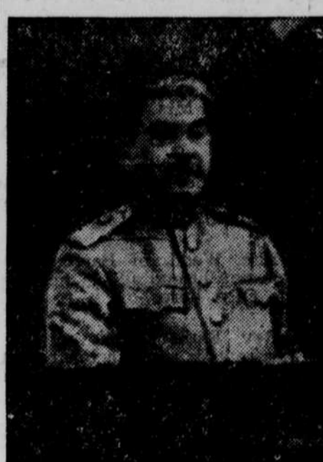
Premier Stalin, of Russia, is shown in this radio photo as he addressed the Soviet Union. He castigated Germany and Japan as aggressor nations. His talk renewed speculation that the Soviet Union will make available some of its resources to the Allies of the Pacific war. Whether this aid would include full participation, or would cover uses of Russian bases has not been determined. Russia's position in northeast Asia is even more vulnerable than Japan's.