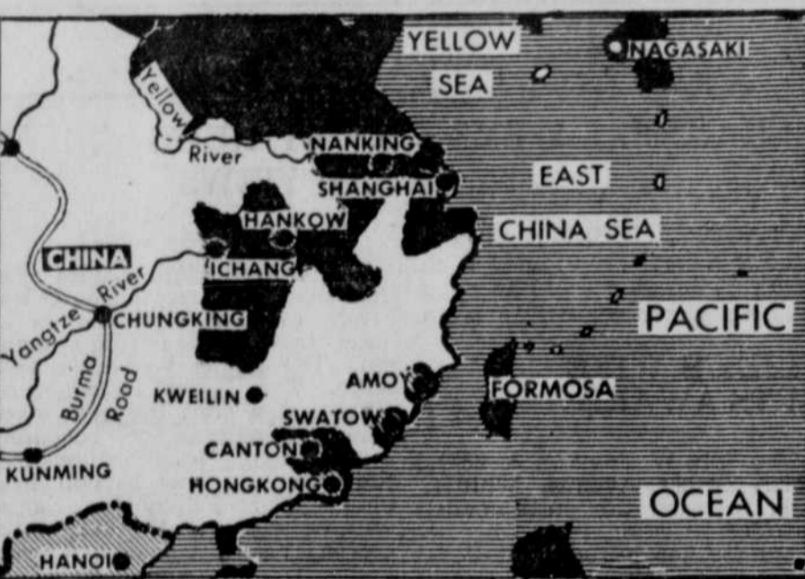
Dark shaded areas on map show extent of Japanese occupation of China, and progress of drive along east coast to seal it off to counteract possible U. S. landings.

Released by Western Newspaper Union. (EDITOR'S NOTE: When opinions are expressed in these columns, they are those of Western Newspaper Union's news analysis and not necessarily of this newspaper.)