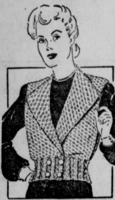
Pattern No. 5640

SO MANY readers have asked that I design a "large-size" vestee which could be easily knitted that I've done this one specially for sizes 38, 40, 42 and 44. Made in maroon or wine-colored yarn it's just the sort of winter vestee which is most popular. Button the lapel over for added warmth under your coat—wear the vestee for comfort in a too chilly house. And it will make a wonderful Christmas gift for the woman who is too busy to do her own knitting!