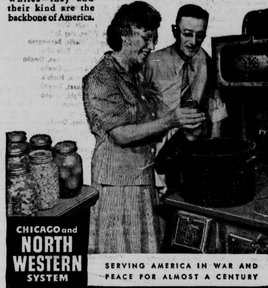
CHICAGO and NORTH WESTERN SYSTEM