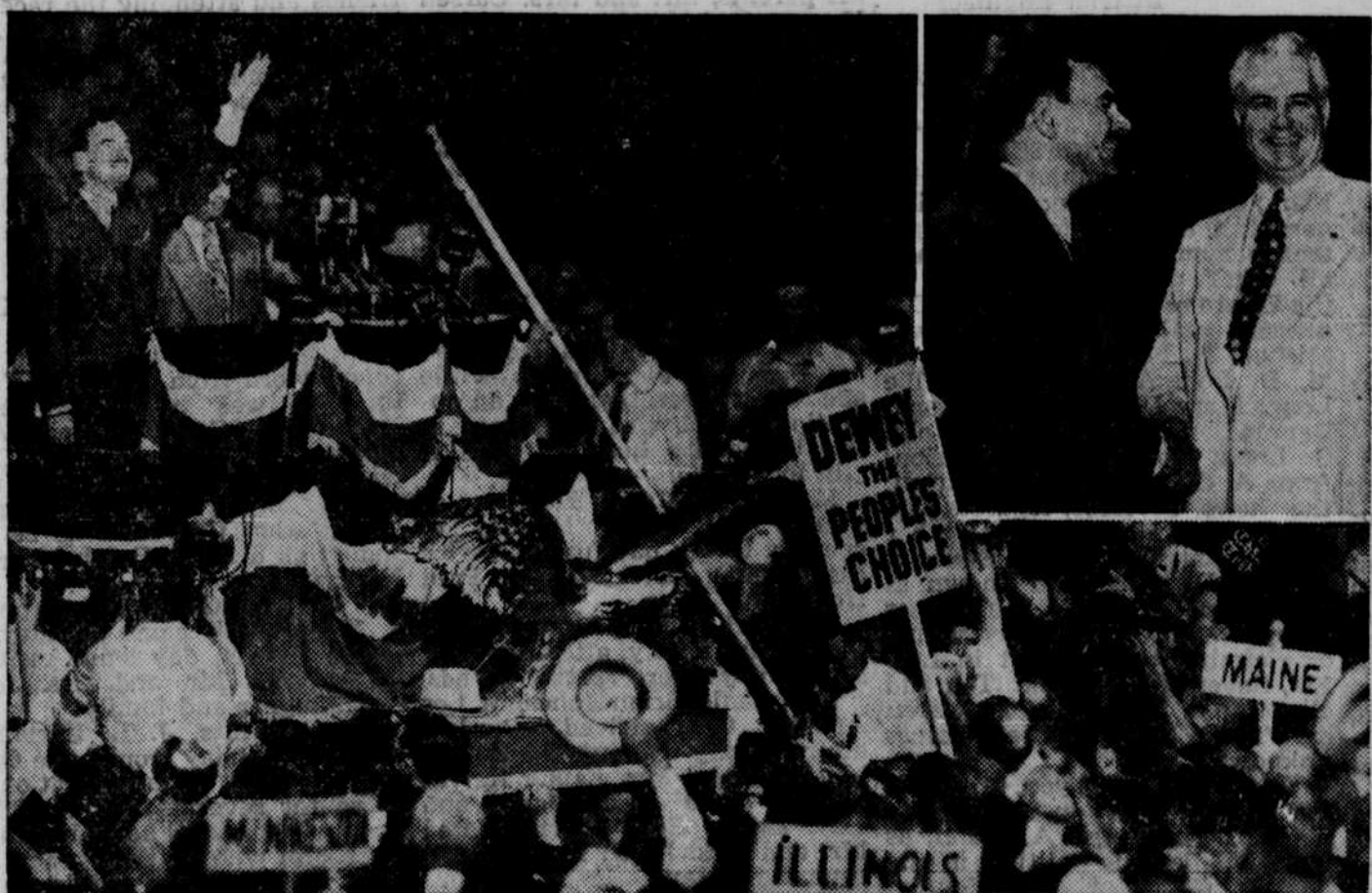
It's Dewey and Bricker and an impressive scene in the Chicago stadium as the Republican national convention delegates stampeded when Gov. Thomas E. Dewey of New York accepted the presidential nomination. Gov. John W. Bricker of Ohio, proved just as popular with the delegates as he clasped hands with Dewey, following his acceptance of the vice presidency nomination.