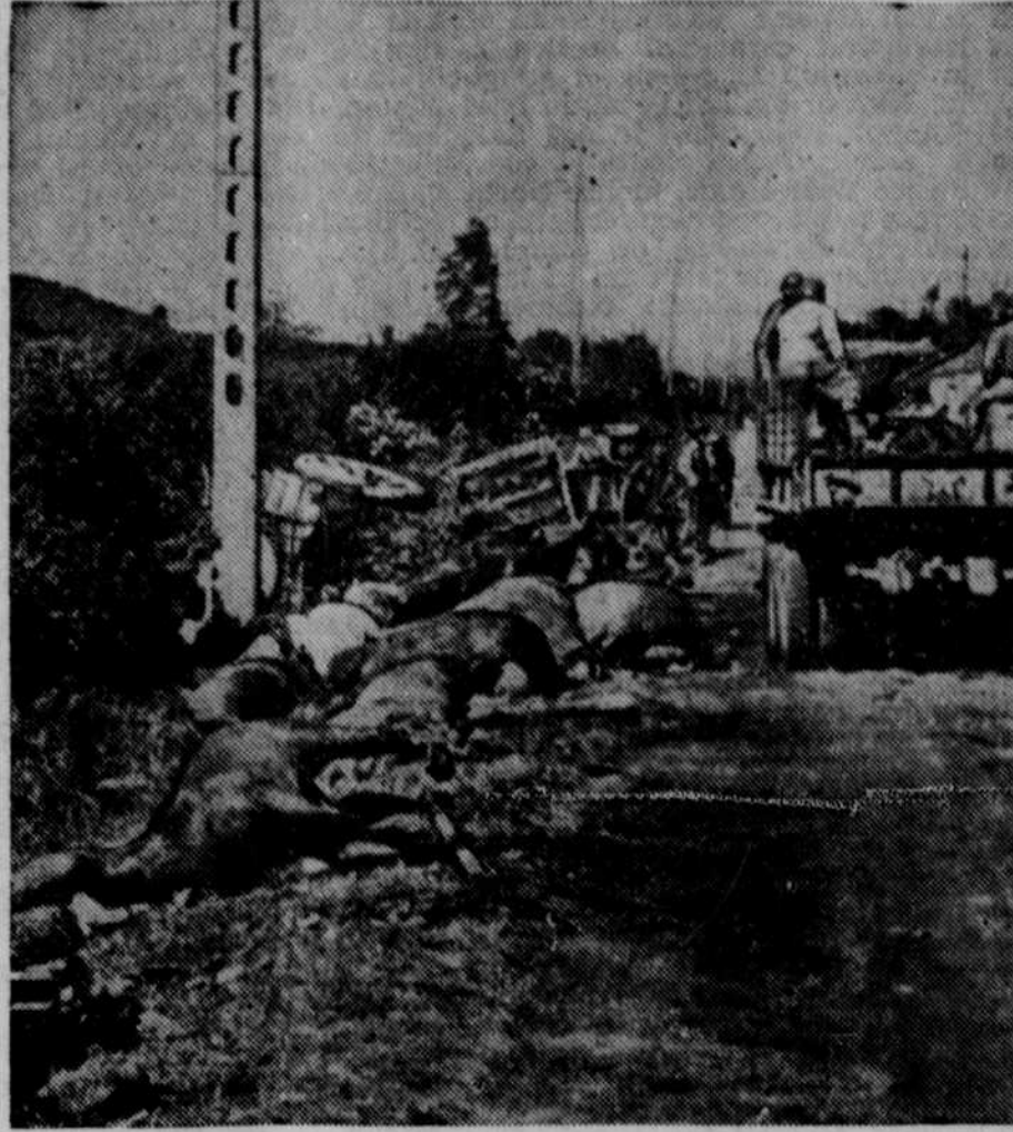
On the road to Barneville, Cherbourg peninsula, wrecked German guns, dead horse and other equipment lie alongside the road after being pushed there by American bulldozers, which cleared the road for the advance of the Allied troops which followed in the advance on Cherbourg. An American truck advances down the road.