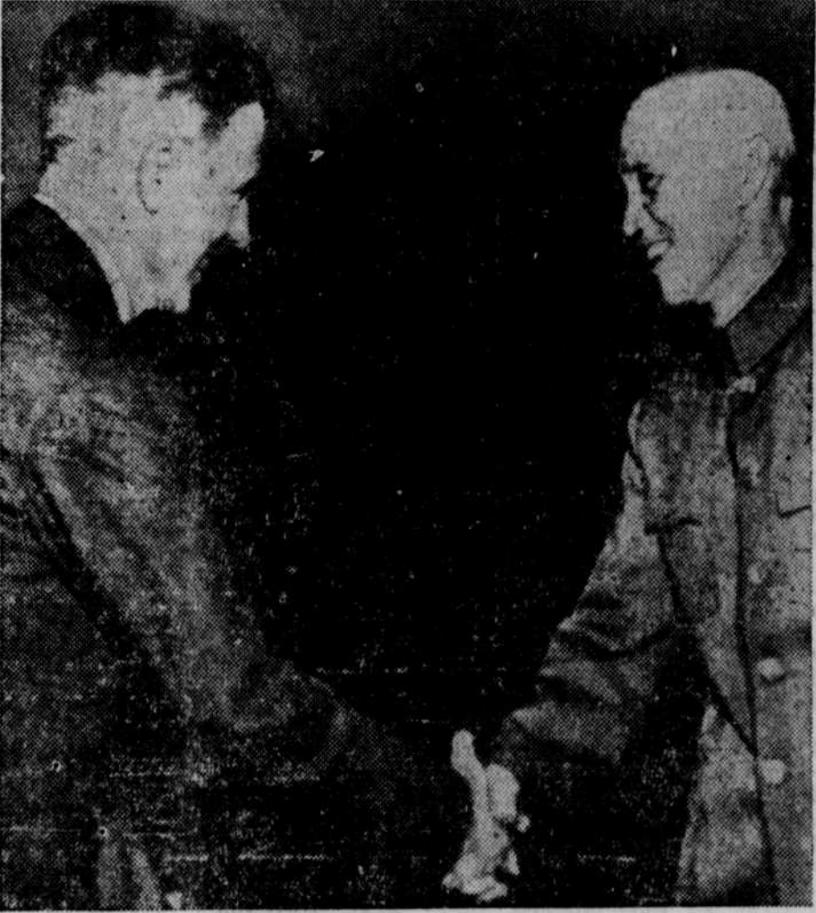
Vice president Henry A. Wallace is shown being welcomed to China by Generalissimo Chiang Kai-Shek, when Wallace's plane landed there. The vice president not only carried state papers, but was well equipped with seeds, industrial plans, various items which had been asked for by welfare organizations operating in China. Before leaving the United States Wallace had "mastered" the Chinese language.