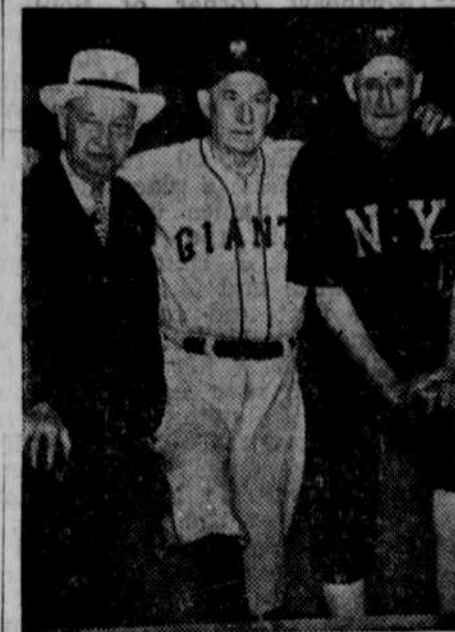
Baseball stars of another era made their appearance at the Polo grounds where the three New York teams, Yankees, Dodgers and Giants, played a three-cornered game for the Fifth War Loan drive. Admission was only by purchase of war bonds.