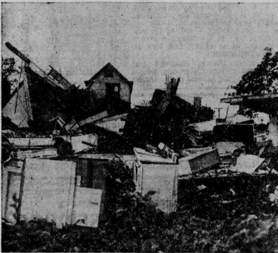
Wash basins and dresser drawers form part of the general wreckage, when the tornado struck B avenue, Liberty borough, Pittsburgh. Houses were lifted completely from foundations and furnishings flung far and wide. List of dead and injured were reported at 134 dead and 1,100 injured in the worst disaster in Pennsylvania's history, since the Johnstown flood. Thousands were taken care of by Red Cross rushed to the scene.