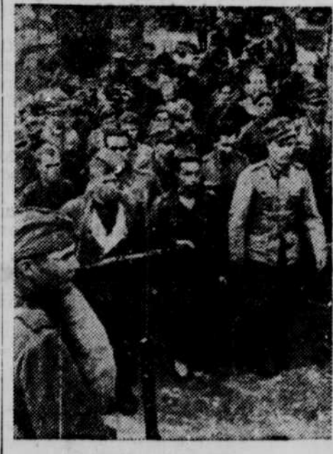
Finnish officers and men taken prisoners on the Karelian Isthmus are shown being marched to prisoner of war enclosures. In the background are some of the fortifications of the Finnish defense zone.