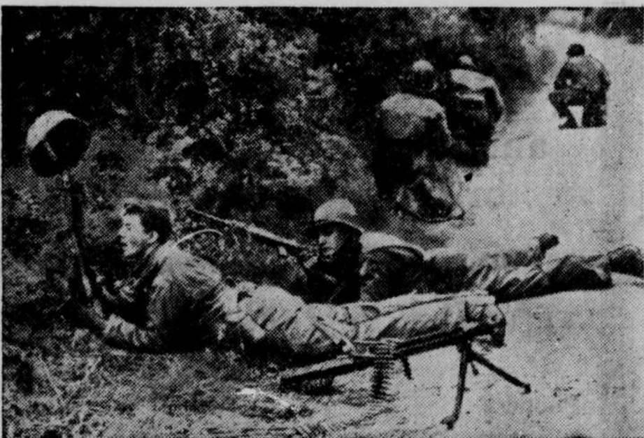
Taking care to keep well down out of harm's way, American soldiers take part in a sniper hunt somewhere in France. The soldier in the foreground pokes his helmet up over the edge of the ditch, hoping and asking for the sniper to take a shot so his position can be located. Snipers soon surrender when located.