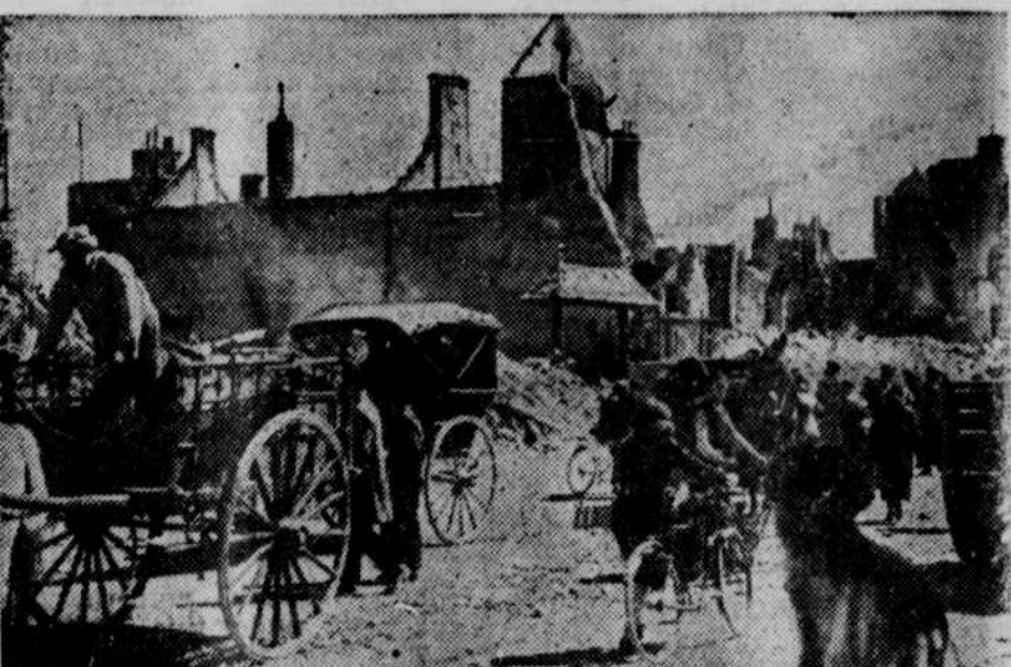
Terrific shelling and bombardment reduced this town of Isigny, France, to just a shell of its former self, but to these Frenchmen it is home as they move back to normalcy in their village after it was occupied by the American army during the invasion of the Normandy coast.