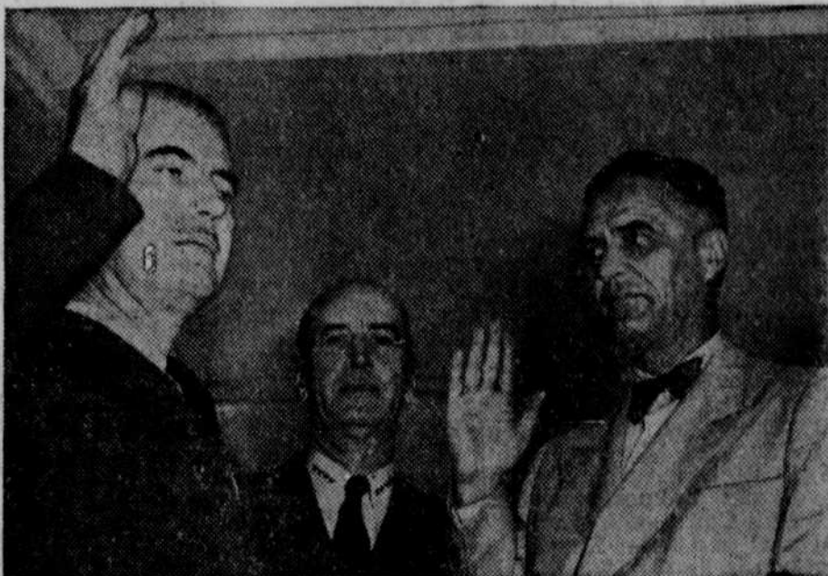
Ralph A. Bard, who handled the navy's labor relations as assistant secretary was sworn in as undersecretary of navy by Adm. T. L. Gatch. Left to right: Admiral Gatch; Adm. Ernest J. King, chief of naval operations; and Bard. He was the personal choice of Forrestal, secretary of the navy, and his appointment met with almost universal approval by congress.