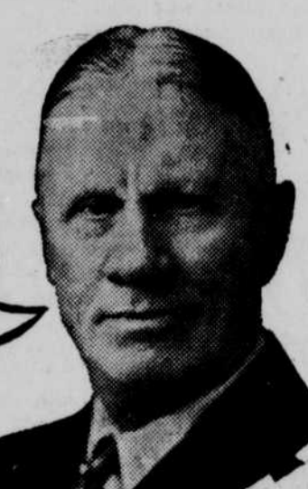
Director of the Brewing Industry's self regulation program in Nebraska, prominent member of state bar, former county attorney, state senator, U. S. District Attorney during prohibition era.

NEBRASKA IS PROUD OF ONE OF THE BEST LIQUOR CONTROL LAWS IN AMERICA