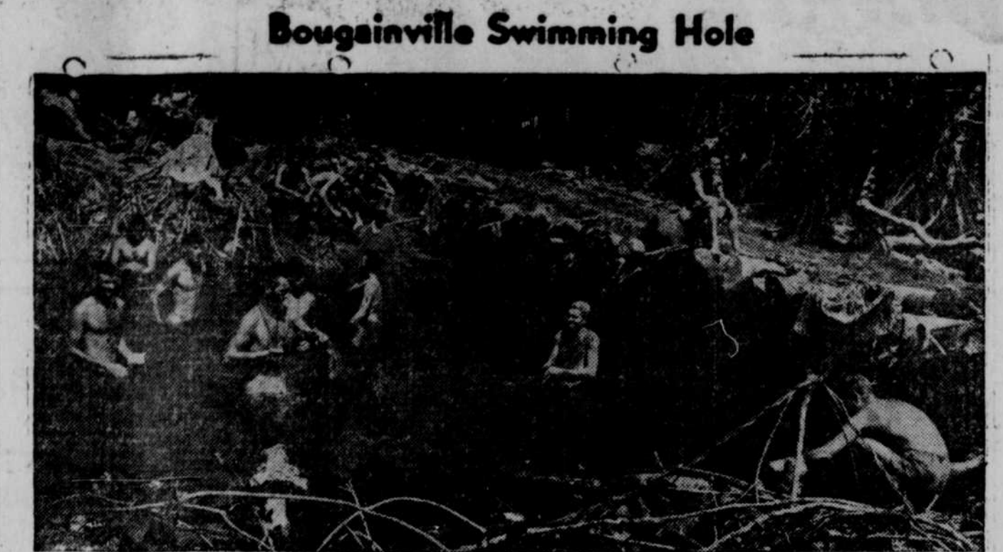
When veteran Leatherneck jungle fighters find both the time and the proper place, they stage an all-out wash day. These Marines, on Bougainville, bathe themselves and give their clothes a thorough washing as well.