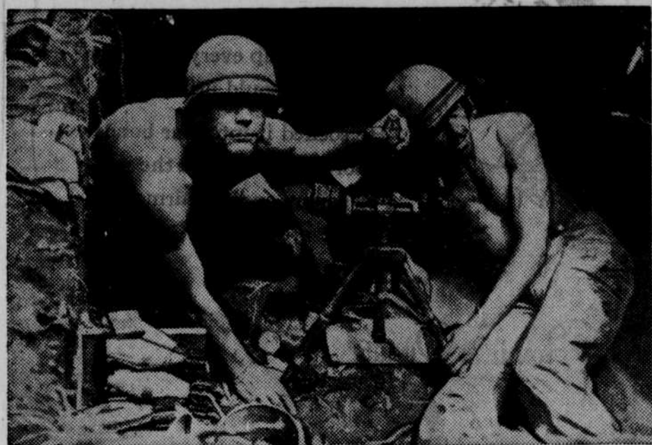
Members of the mortar crew of the Americal division, the only unnumbered army outfit overseas (all veterans of Guadalcanal), again see action—this time on Bougainville. Here two members of the unit are operating a 60-mm. mortar on Bloody Hill 260 where hundreds of Japs died from vicious counterattacks by American infantry soldiers.