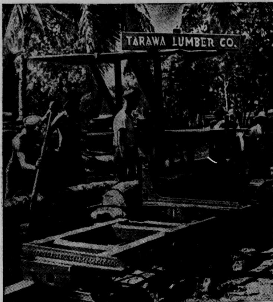
This sawmill was imported to Tarawa to aid in the reconstruction of the former Japanese base after the marines took it in the bloodiest battle of their history. The mill turns out lumber for tent frames, flooring and many other uses. The navy Seabees and marine engineers have done a masterful job in improving this important Gilbert Island base.