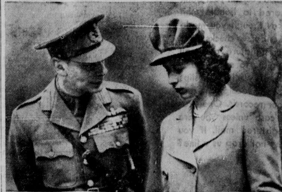
King George VI is pictured here with head turned to a charming and interested princess—his daughter. The photo was made during a stop on the first full-length journey of the princess when she accompanied her royal parents on a tour of inspection of Scottish troops and armored infantry outfits.