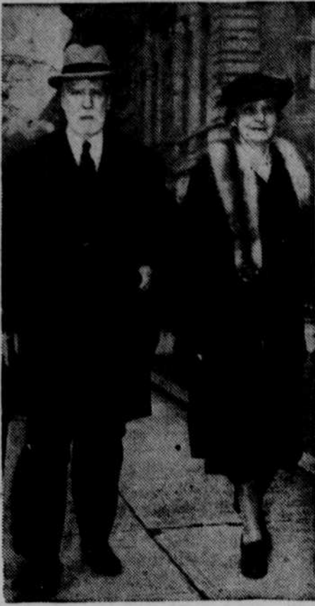
Charles Evans Hughes and wife are shown here enjoying an early morning stroll in Washington, D. C., following a winter spent in Arizona "enjoying life." Hughes, who retired as chief justice of the Supreme court in 1941, recently celebrated his 82nd birthday.