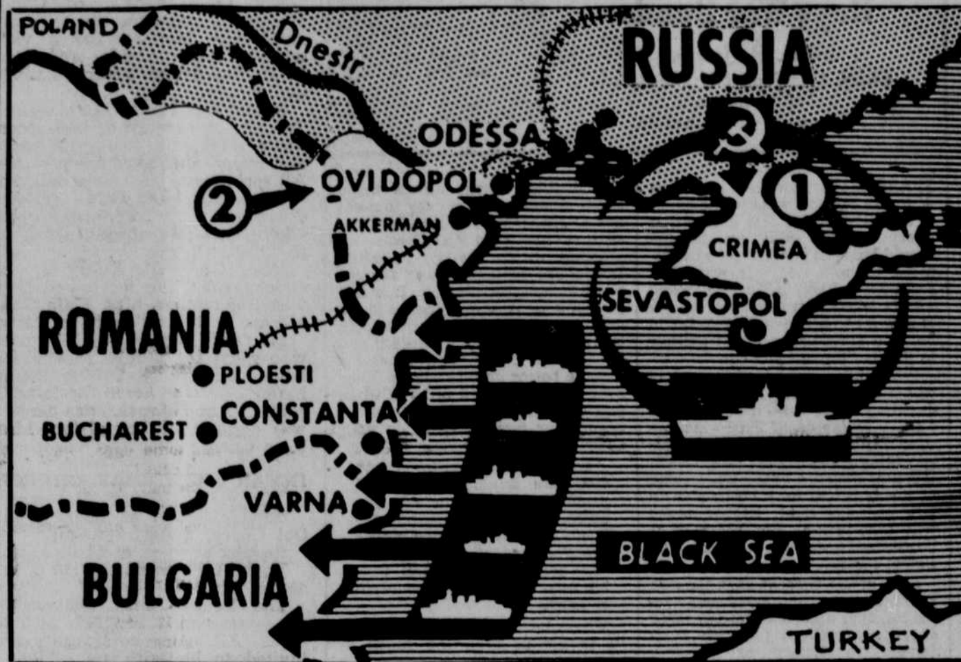
Swift and dramatic strokes came in the wake of the great Red victory at Odessa. By a sudden thrust at the Perekop isthmus the Russ had undertaken a move to cut off Crimea and gain Sevastopol. Action from sea, as well as land, was expected along the Romanian and Bulgarian coasts as well, following the Crimea offensive. Ships of the Black sea fleet had stood by for amphibious operations. Another move was a quick dash which cut the rail line at Ovidopol to trap Nazi forces hoping to escape.