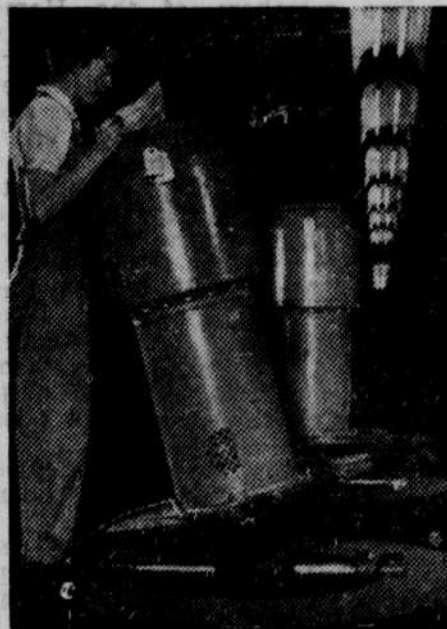
Final test on Scorsby machine used by the U. S. navy as "invasion gyro-compass." The young woman in the photo takes reading under simulated sea conditions.