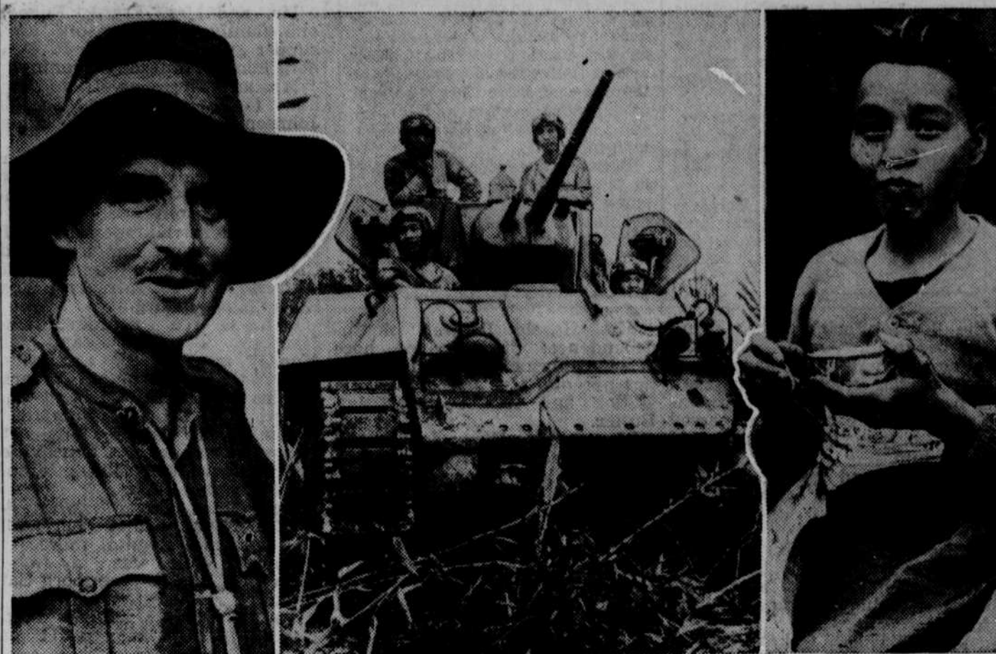
Three scenes from the Burma front and what makes it tick: Left: F. Messerby, commander of the 7th Indian division of the British 14th army. Center: A U.S. tank and American-trained Chinese tank crew who demonstrated to the Japs in the battle of Walumbum just how well-trained they were in the use of modern weapons of war. Right: Chinese boy of American-trained transport unit enjoys his meal of rice, girded with a captured Jap battle flag for an apron.