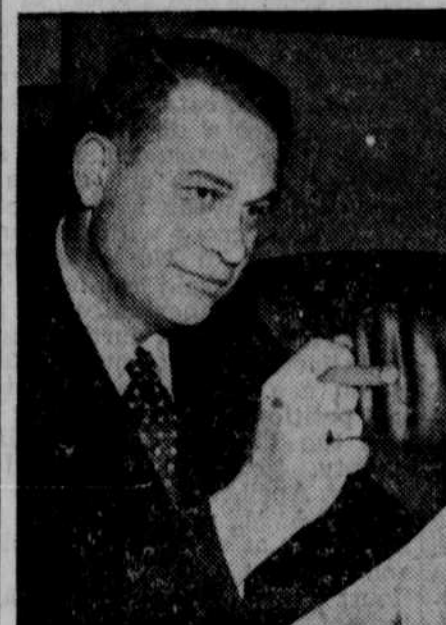
Rep. Martin Dies (D) of Texas and chairman of the committee on un-American affairs. The house investigator stated that those who specialize in "vicious propaganda" on the air may be called to account.