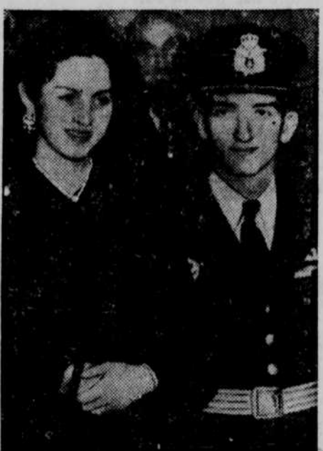
King Peter of Yugoslavia and his bride, the former Princess Alexandra of Greece, are pictured here leaving the Yugoslav embassy in London following their wedding.