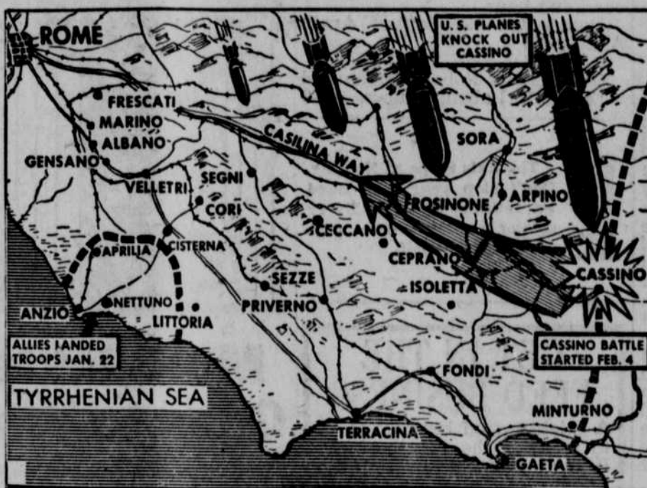
In the most devastating aerial assault in history Yank bombers destroyed Cassino, dropping more than 2,500 tons of bombs on the town. This record weight of explosives was concentrated in about one square mile. Heavy guns finished the job. Then ground troops moved in. While this was taking place, RAF planes attacked the Nazis at Aprilia.