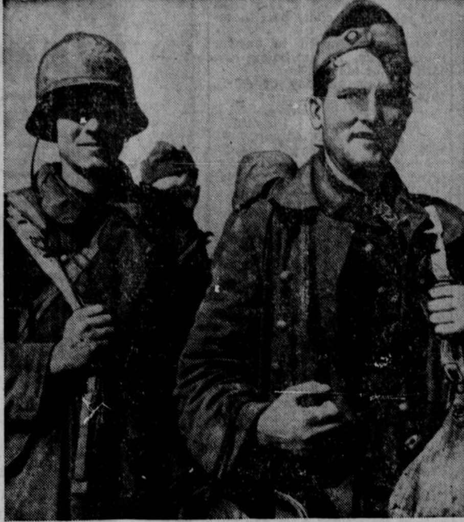
These two Nazi soldiers, captured from the lines near Carroceto, Italy, were also caught by the camera of an alert signal corps photographer. Completely unconcerned at being taken prisoners, the pair smile broadly for the cameraman. Or perhaps at their pleasure at having been captured.