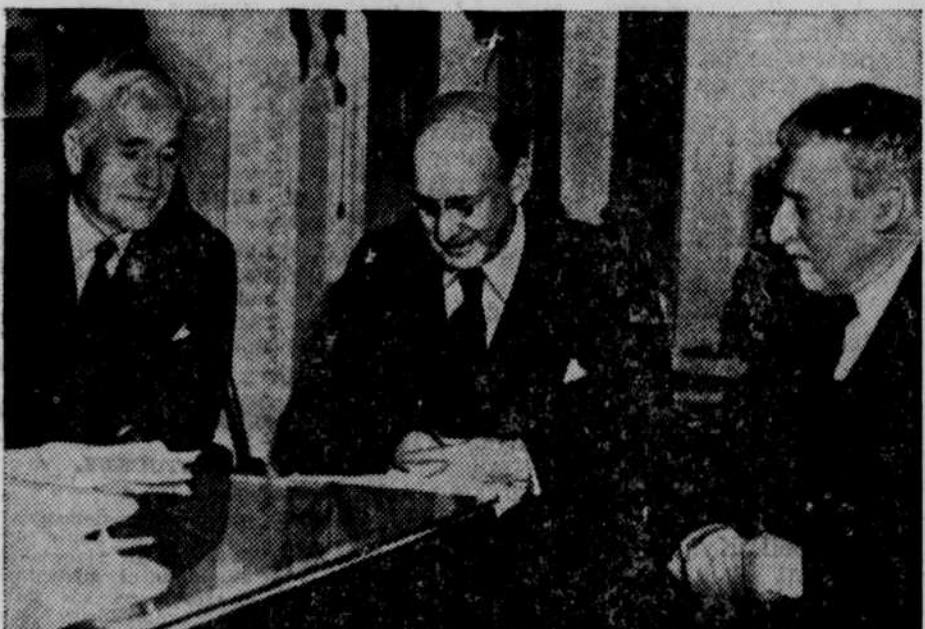
Members of the War Refugee board, created last January by President Roosevelt, hold their initial business meeting. The aim of the board is to develop plans to transport, maintain and give relief to the victims of the enemy oppression. Left to right: Secretary of State Cordell Hull, Secretary of the Treasury Henry Morgenthau Jr., and Secretary of War Henry L. Stimson.