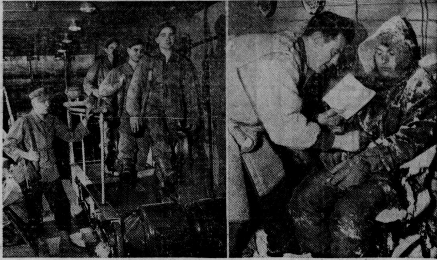
The infantry takes it standing up—and sitting down—in tests at the Corps Climatic laboratory at Lawrence, Mass. It is here that the quartermaster corps charts reaction of men and checks effectiveness of equipment under simulated tropical and arctic temperatures. Left: Three infantrymen with full packs undergo discomforts of an endless treadmill hike under broiling sun in the jungle chamber of the laboratory. Right: Observer checks clothing and condition of soldier who sits it out in searing 40 below zero frigidty of the cold test room.