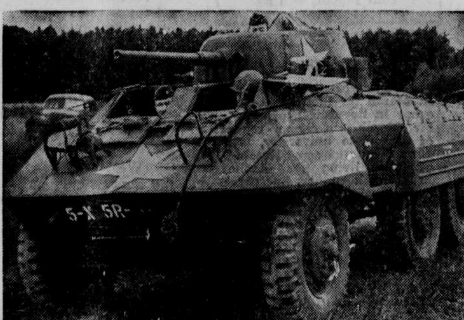
This is the armored car, M8, latest combat vehicle addition to the army's mechanized equipment. Designed by ordnance department to combine speed of the auto and punch and protection of the tank, debut discloses M8 as six-wheeled, weighing eight tons. It mounts 37-mm. cannon and .30-caliber machine gun and is manned by a crew of four.