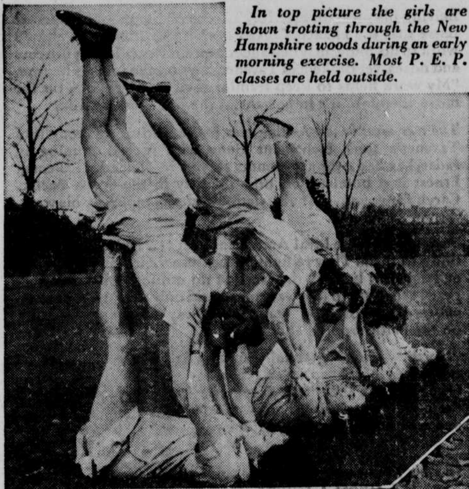
In top picture the girls are shown trotting through the New Hampshire woods during an early morning exercise. Most P. E. P. classes are held outside.

P. E. P. is becoming a "must" in American schools. In order to cut down the number of unhealthy U. S. citizens, students are urged to enroll in physical educational programs. Coeds of the University of New Hampshire are shown at physical fitness classes.