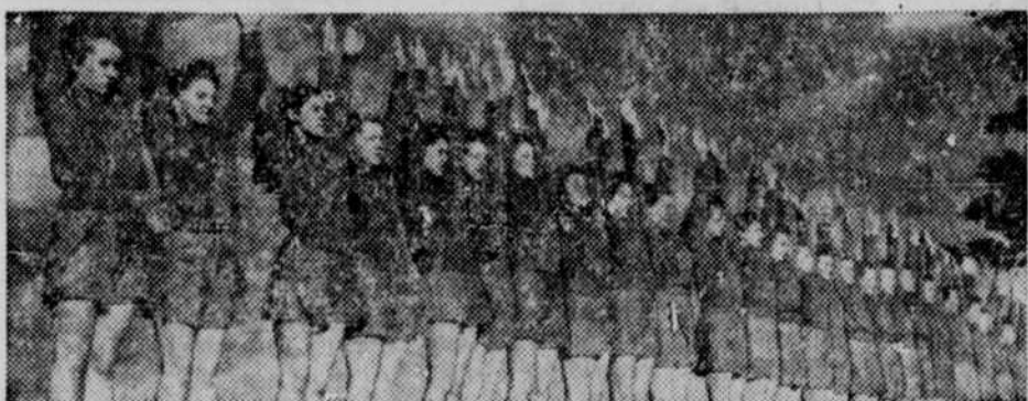
These are freshmen lined up for stretching exercises.