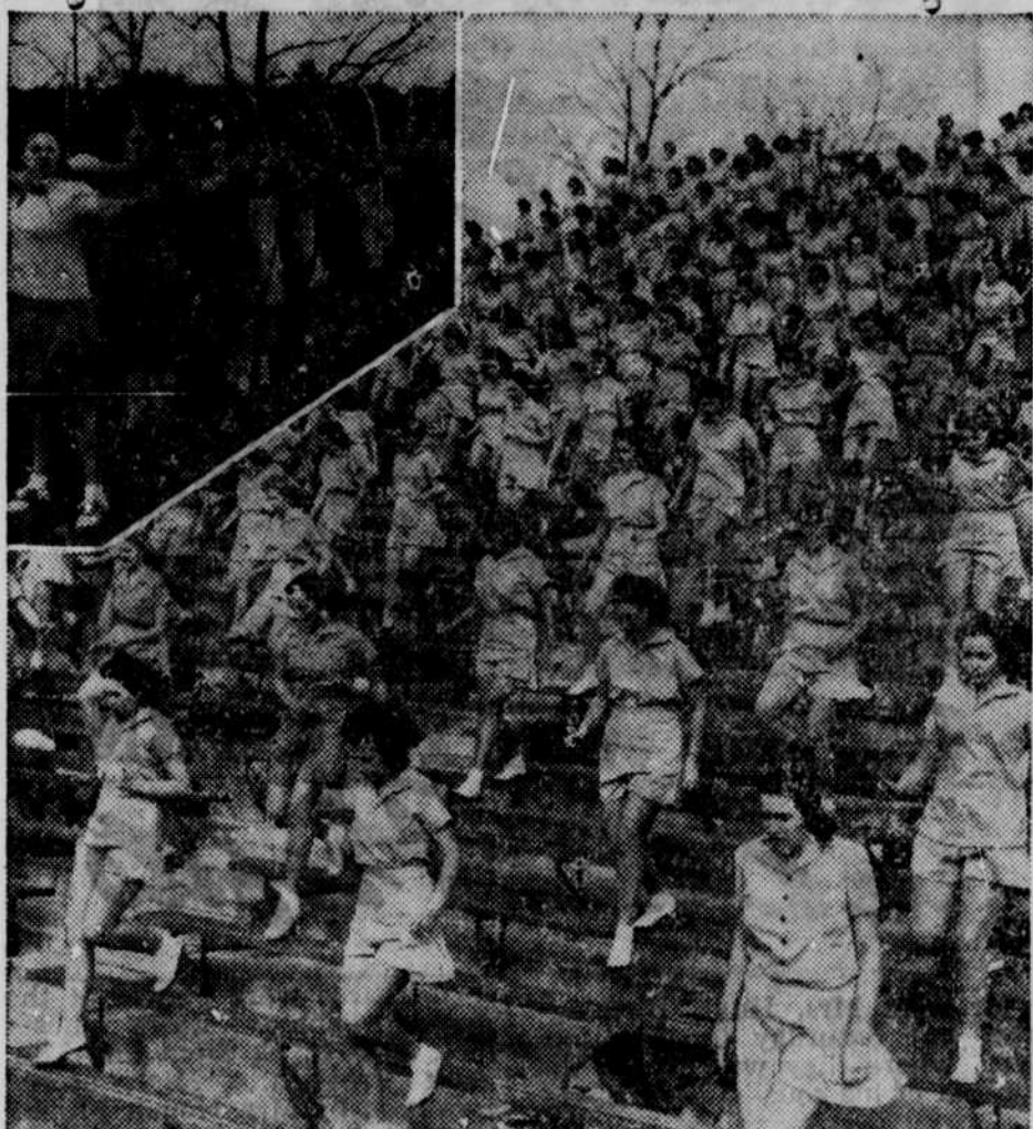
Archery is included in the P. E. P. program. In top inset belles and their bows are shown lined up on the field. One of the best limbering-up exercises makes use of the grandstand. Instead of just sitting, these coeds run all over it.