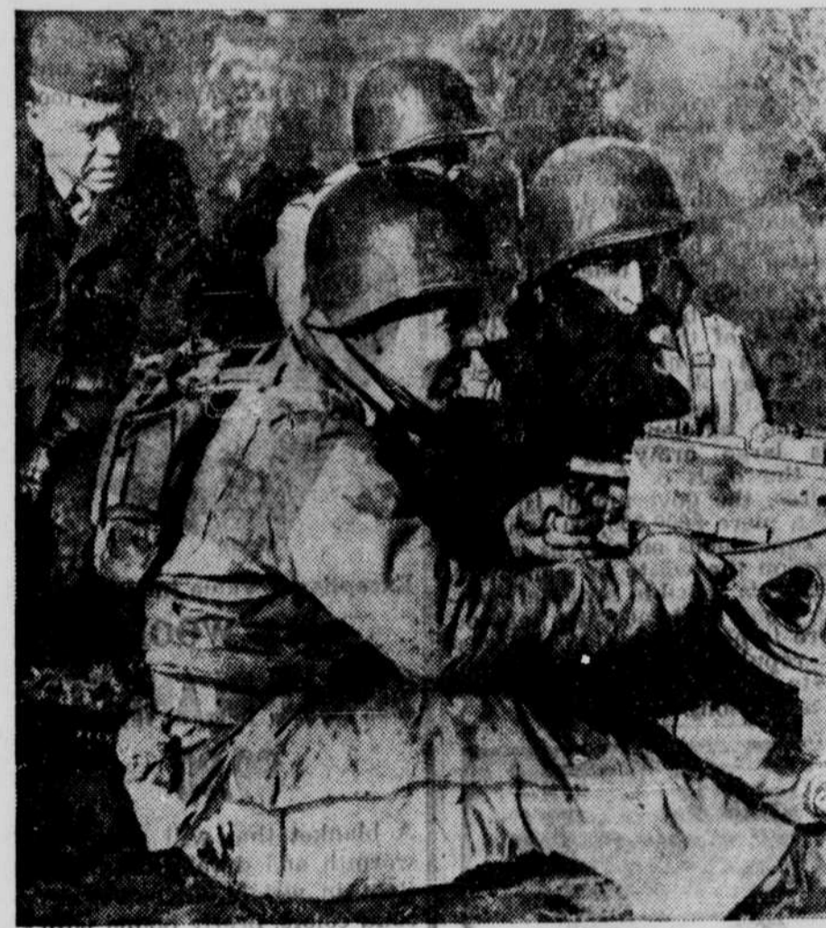
Maj. Gen. William Rupertus, U. S. M. C., who commanded the marine units that attacked the twin Japanese airfields behind Cape Gloucester, New Britain, is shown (left) coaching a Leatherneck gun crew during preparations for that action. Soon after this attack marines were reported to be advancing in the face of stubborn enemy resistance.