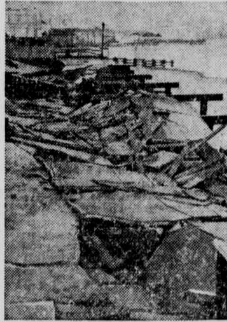
This picture, taken on the ocean front at Redondo Beach, Calif., shows how tides and pounding waves have turned the concrete walkway into a series of broken blocks.