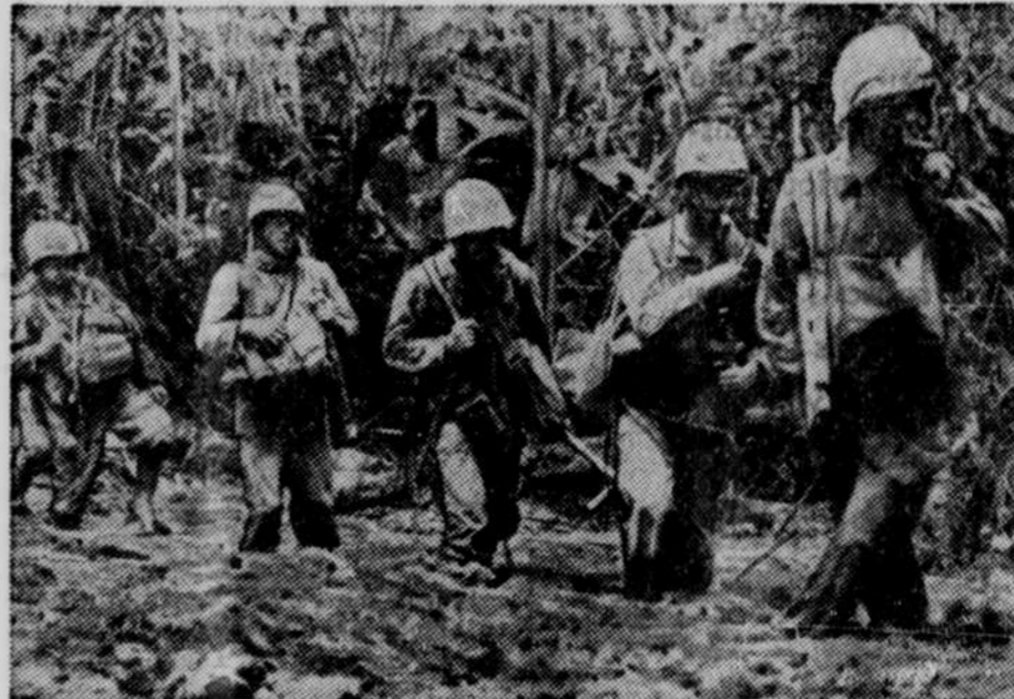
Heavily laden marine infantrymen sash through deep mud of a jungle trail as they near the battle front. Continued American attacks on Japanese positions in the Pacific are steadily lengthening our striking power from the air. As the battle continued on Bougainville, American troops battled toward Rabaul which is considered a vital Japanese base.