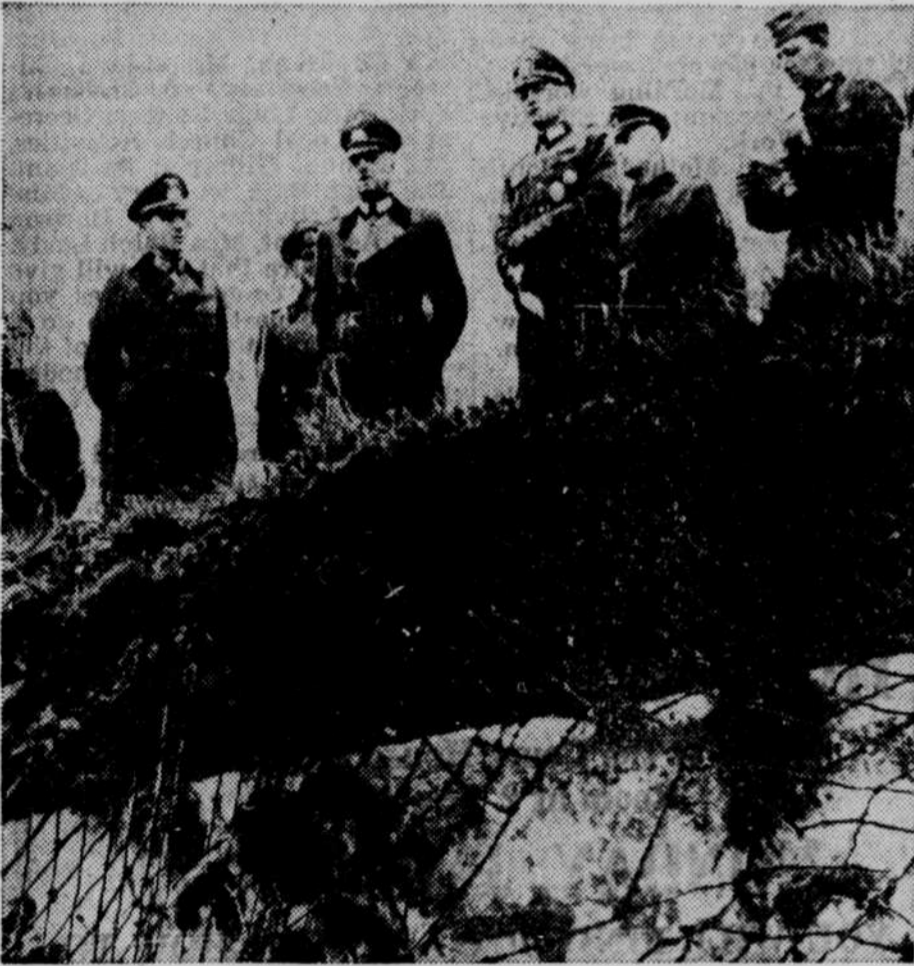
Field Marshal Von Rundstedt, who commands German forces in western Europe, is shown as he inspected a sector of the "Atlantic wall" defenses recently. The entire war psychology of Germany apparently has passed from the offensive to the defensive and constant predictions were being made by Nazis as to the date of an Allied invasion from England.