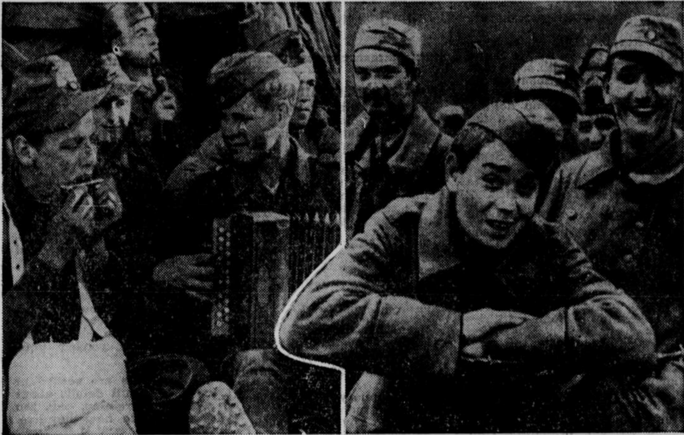
Left: A few hours rest has been granted to these Nazi soldiers who are pictured entertaining themselves somewhere along the Russian front. With Russia's great ally, winter, now in action there is little time for rest in German ranks. This picture was found by the Russians. Right: This photograph which was radioed from Algiers shows young Nazi prisoners of the 28th panzer regiment taken captive in Italy. They smile at the camera, apparently pleased that they are prisoners and no longer must fight and face the difficulties of war against the Allies.