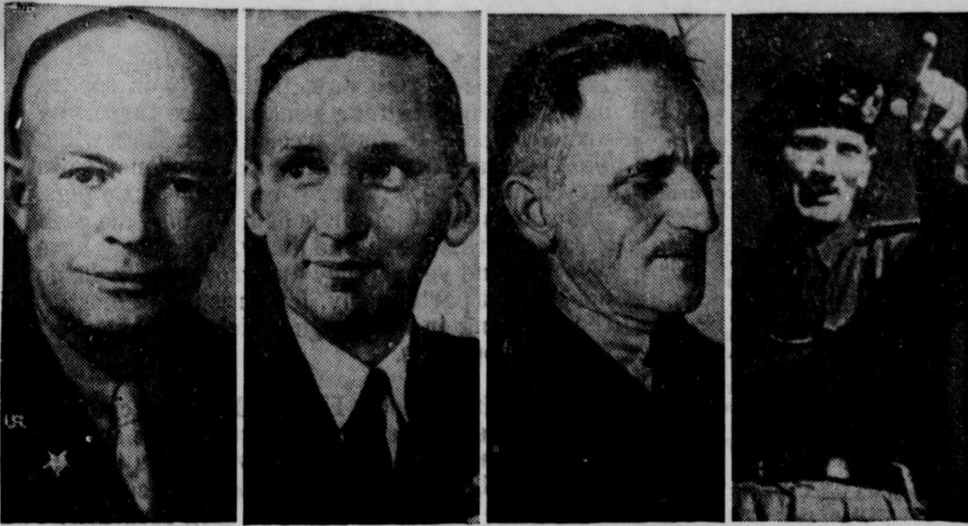
These are the men who will lead the long awaited Allied "second front" invasion of Europe. Left to right: Gen. Dwight D. Eisenhower, supreme commander of Allied invasion armies; Air Chief Marshal Sir Arthur Tedder, deputy to Eisenhower; Lieut. Gen. Carl Spaatz, chief of all the American strategic air forces that will hit Germany from west and south; and Gen. Sir Bernard L. Montgomery, chief of the British land armies. Appointment of Tedder as Eisenhower's deputy indicated that air power was to be a major weapon in the battle to crush the fortress of Europe. Eisenhower, who had never before made a prediction in 13 months of warfare, announced as he left Algiers to assume his new post that "we will win the European war in 1944."