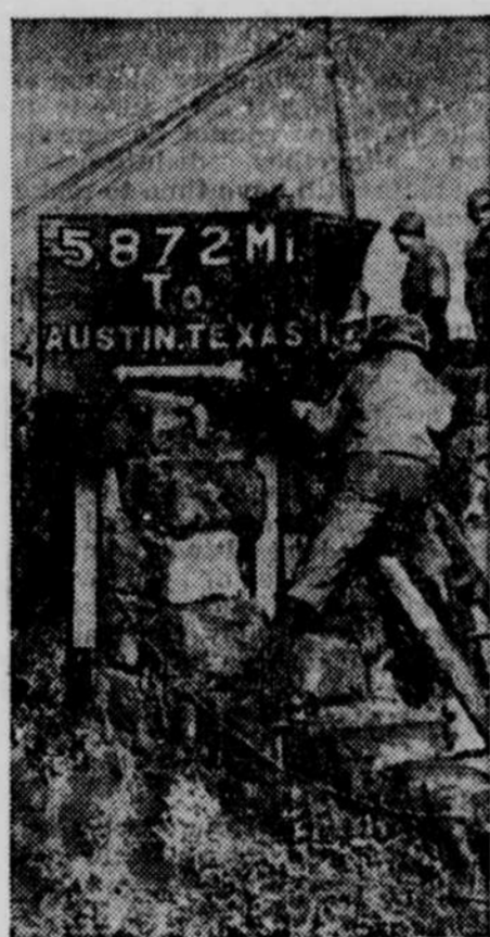
Rome to Berlin, and then home—that, apparently, is the route most servicemen in Italy want to travel. This sign printed there by Yanks when off duty tells the distance to Austin, Texas, via that route. Jugoslavian troops were reported to be invading Italy from the north.