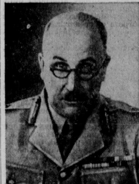
Sir Henry Maitland Wilson, who was named supreme commander in the Mediterranean theater of war succeeding General Eisenhower of the United States. Wilson formerly was the British commander in chief of the Middle East.