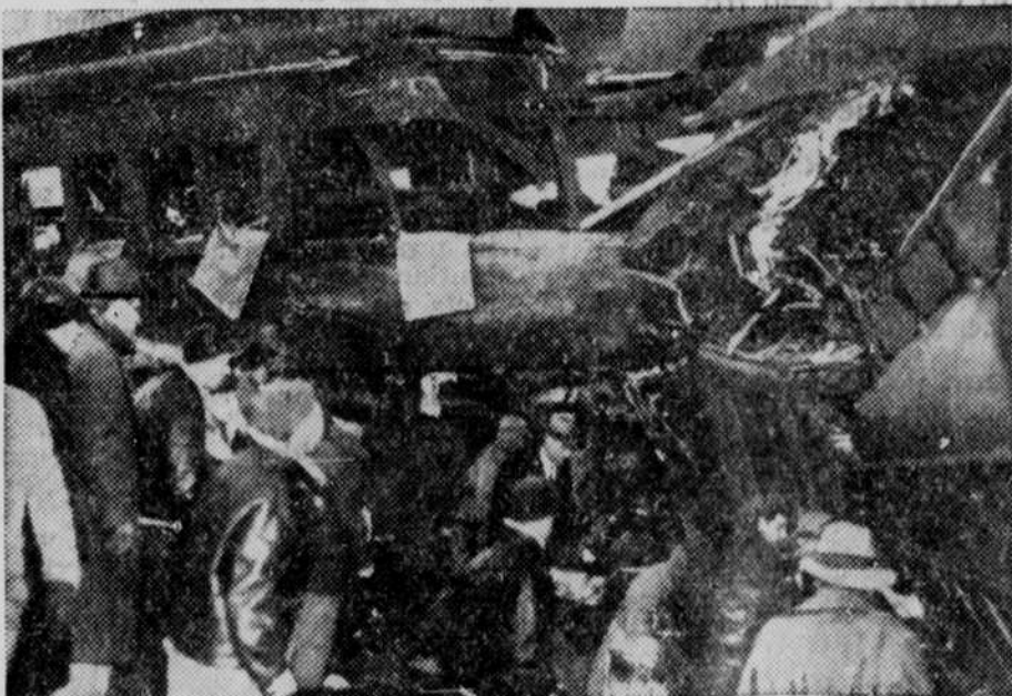
Wreck of the Atlantic Coast Lines' two streamlined trains which killed 72 and injured approximately 100. Workers using torches are shown attempting to reach victims. Cars of one train were derailed and a few minutes later the second train crashed into the derailed coaches despite bonfire signal which had been built by passengers of the first train.