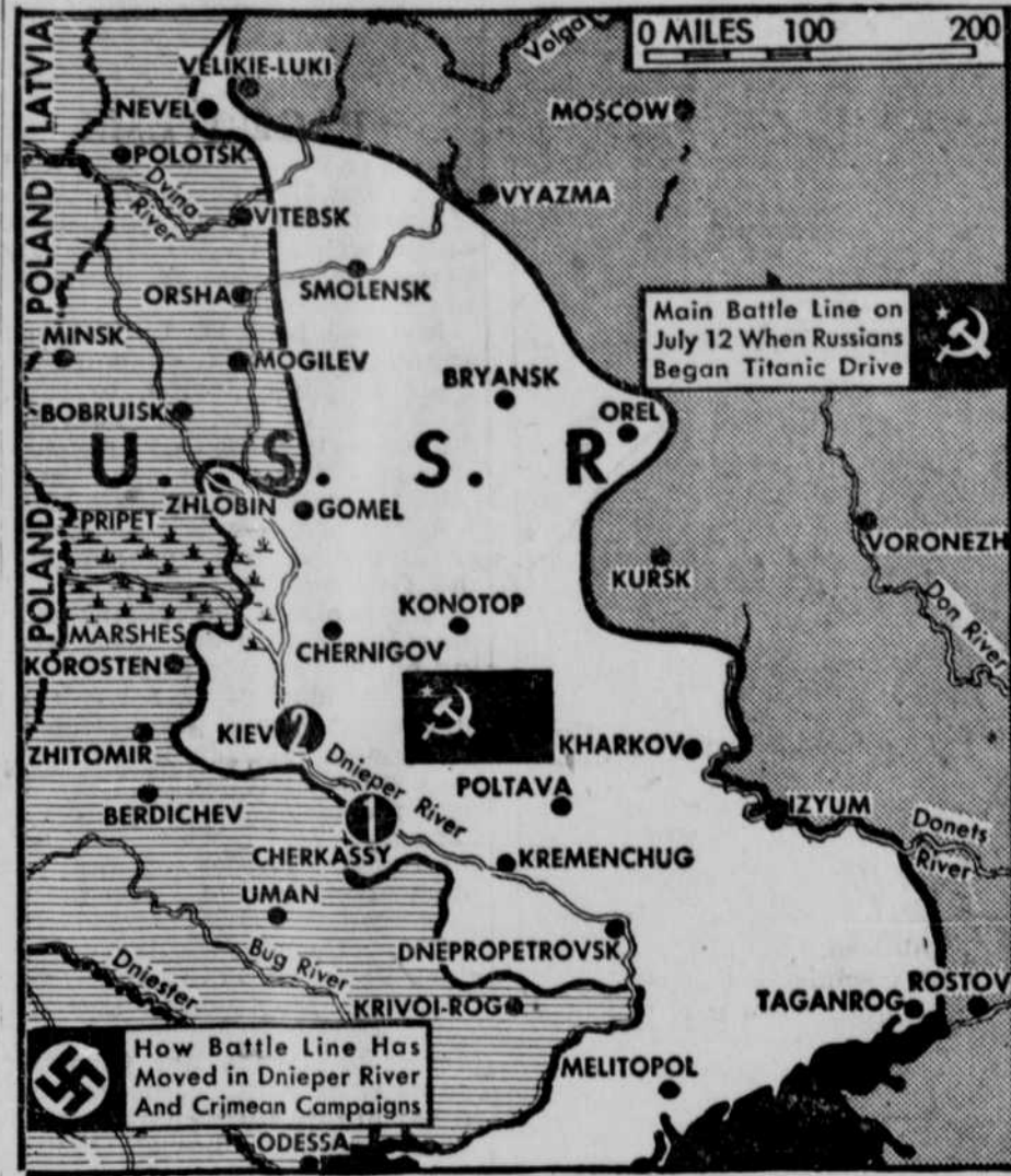
With their great ally winter now increasing in strength and ferocity daily, the Russians have begun new drives to crush the Nazi invader. A full-scale push toward Rumania was begun at (1) Cherkassy. At Kiev (2) a fierce Nazi counterattack failed with heavy losses. Map shows the line of furthest German advance on July 12 and indicates the approximate present front.