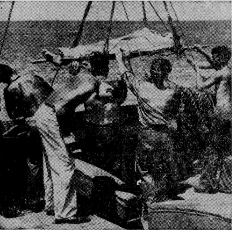
U. S. coast guardsmen bring a wounded marine aboard their transport posted near the bloody beach of Tarawa. He was one of the 2,700 casualties suffered by the marine corps in the bitterest battle of its career. Withering fire from heavily fortified Japanese concrete pillboxes caused most of the marine casualties.