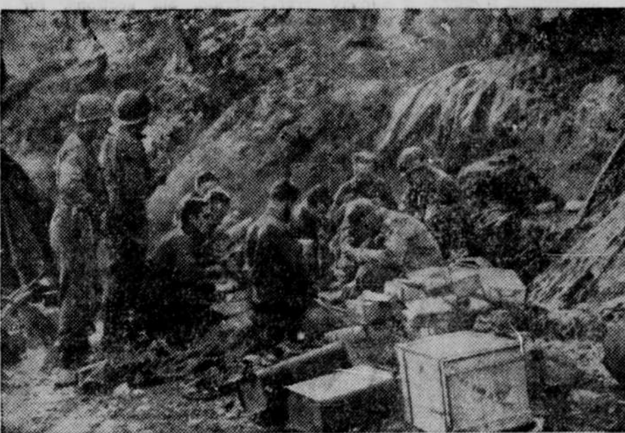
American fighters in Italy celebrate Christmas when their presents arrive from home. As a rule the packages are too cumbersome to be carried around until December 25. This group of men is shown opening their presents near a battle zone. Several unopened packages are lying in the foreground.