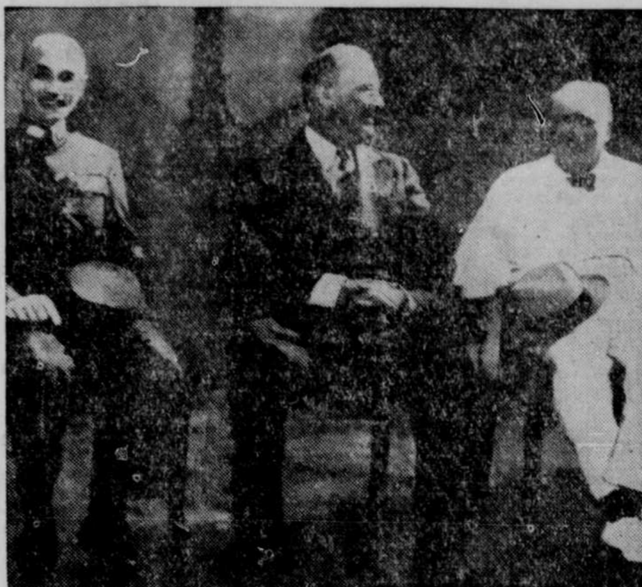
Generalissimo Chiang Kai-shek, President Roosevelt and Prime Minister Churchill, representing the triumvirate of China, the United States and Britain, as they conferred in Cairo, Egypt. Decisions were reached to beat Japan into unconditional surrender and to force her to give up all the islands she has seized in the Pacific since the Sino-Japanese war in 1894, and all other territories which she has taken by violence and greed. Later, at a conference in Iran, Roosevelt, Churchill and Premier Josef Stalin of Russia were reported to have decided on a similar policy toward Germany. Germany, it was reported, would be quarantined as the world's No. 1 aggressor and thrown back inside her original borders. Unless Germany surrenders unconditionally it is believed she will be subjected to more of the intense bombing which has destroyed much of Berlin.