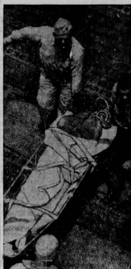
All 70 Jap planes which attacked a U. S. navy task force in the Pacific recently were shot down after an hour-long battle. A wounded gunner from an American plane is pictured being wheeled to sick bay after the battle.