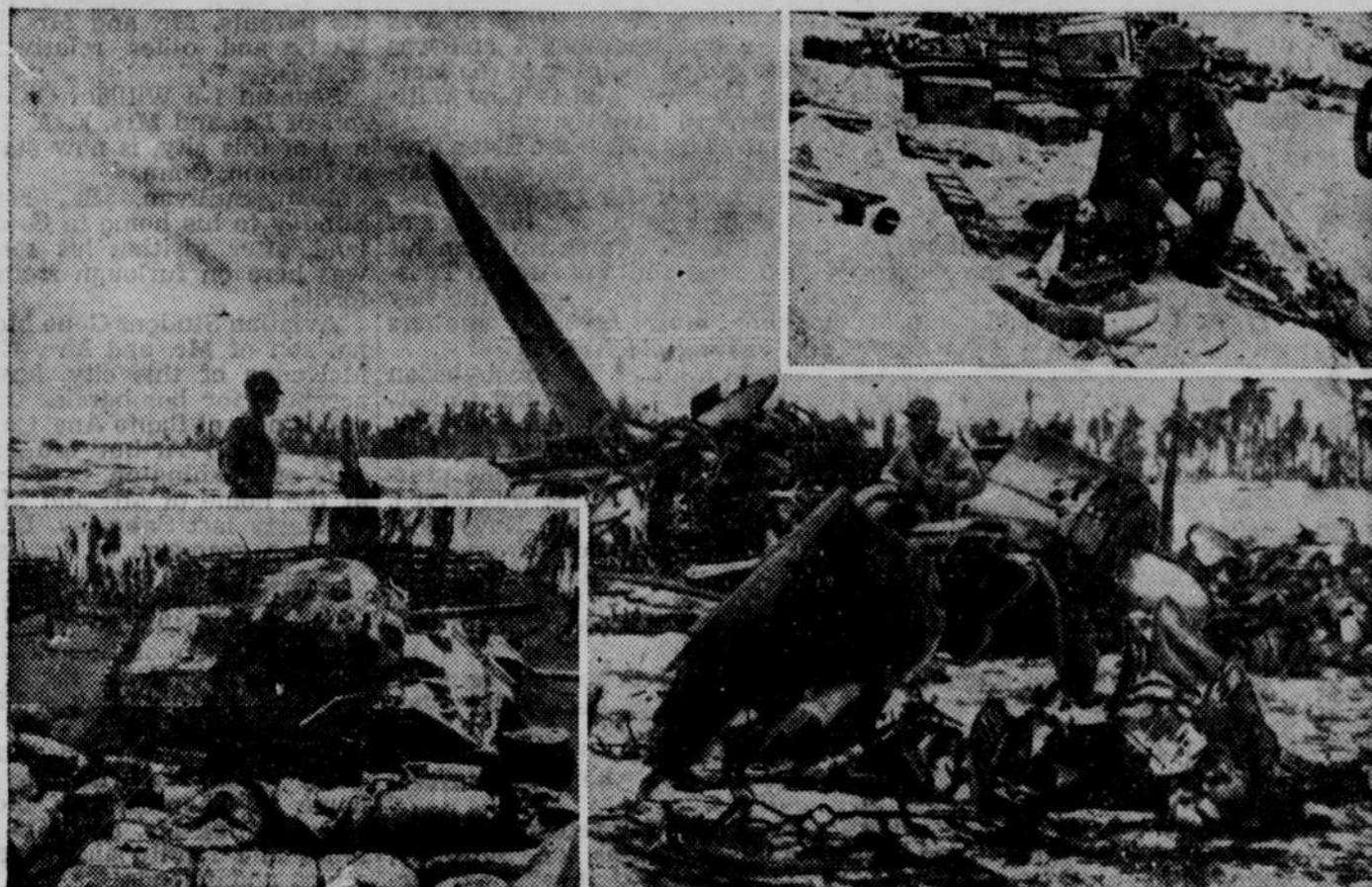
After 76 hours of the bitterest fighting ever to be encountered by the United States marine corps in its 168 years of brilliant battling, the island of Tarawa was wrested from Japanese defenders, most of whom were killed. Lower left: An American tank after it had been disabled. Right front corner of the tank has been torn away and the treads wrecked. Center: Marines inspect a wrecked Jap plane. Top right: Legs of a dead Jap protrude from a pillbox.