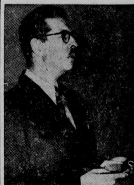
Ex-King Carol of Rumania is pictured making a statement to the press after his intended broadcast to the United States from Mexico was stopped. Carol has been refused entrance to this country by order of the state department.