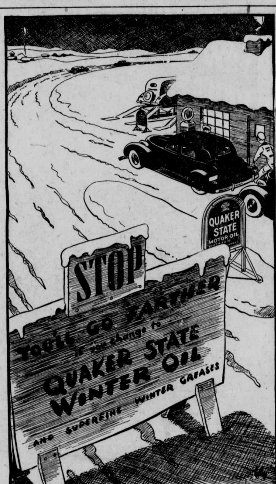
Retail price, 35¢ per quart. Quaker State Oil Refining Corporation, Oil City, Pa.

Sacred Abuse If you would create something The older the abuse the more you must be something .- Goethe. | sacred it is .- Voltaire.