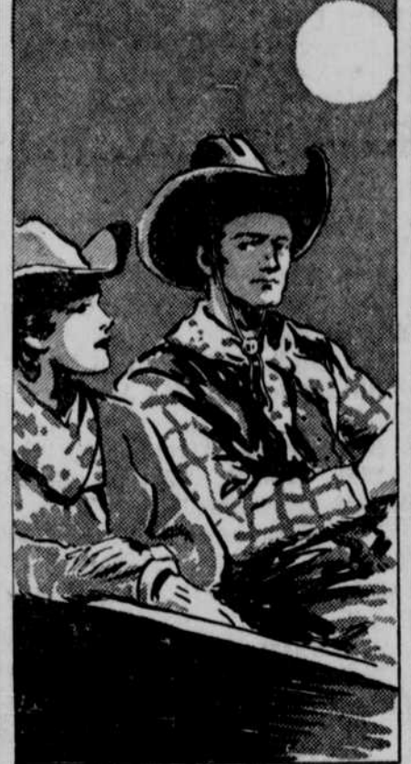
Marian Dunn Sat Perfectly Still.

Billy Wheeler let the others turn Horse Dunn's car in the road and start back toward the 94, before he started his engine. Even after he had set his roaster rolling he drove slowly, half paralyzed with the