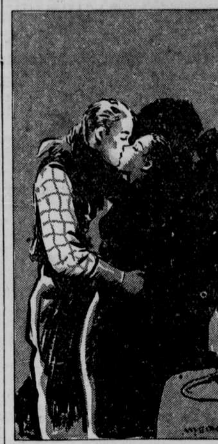
His Hungry Mouth Found an Answering Quiver in Her Lips.

He said slowly, "I was the one who was a fool." He never knew what move he made that brought her into his arms. With the barrier gone between them at last they found themselves in each other's arms as naturally, as unhurriedly, as inevitably as the dry land takes up the rare rains; and his heart lifted up like the April grass of the dry ranges, when the snow-lock melts off and is forgotten as if it had