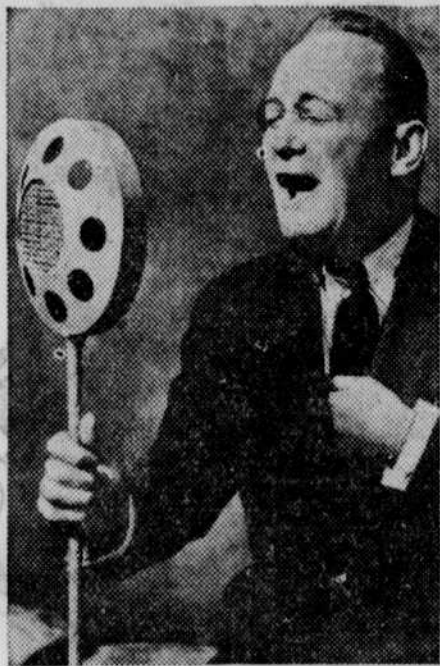
President Roosevelt in what is called one of the most daring satirical performances ever presented on the stage—"I'd Rather Be Right." The play opened in Boston recently.

Forsaking his usual American flag, George M. Cohan waves a microphone as he portrays a typical fireside address while burlesquing