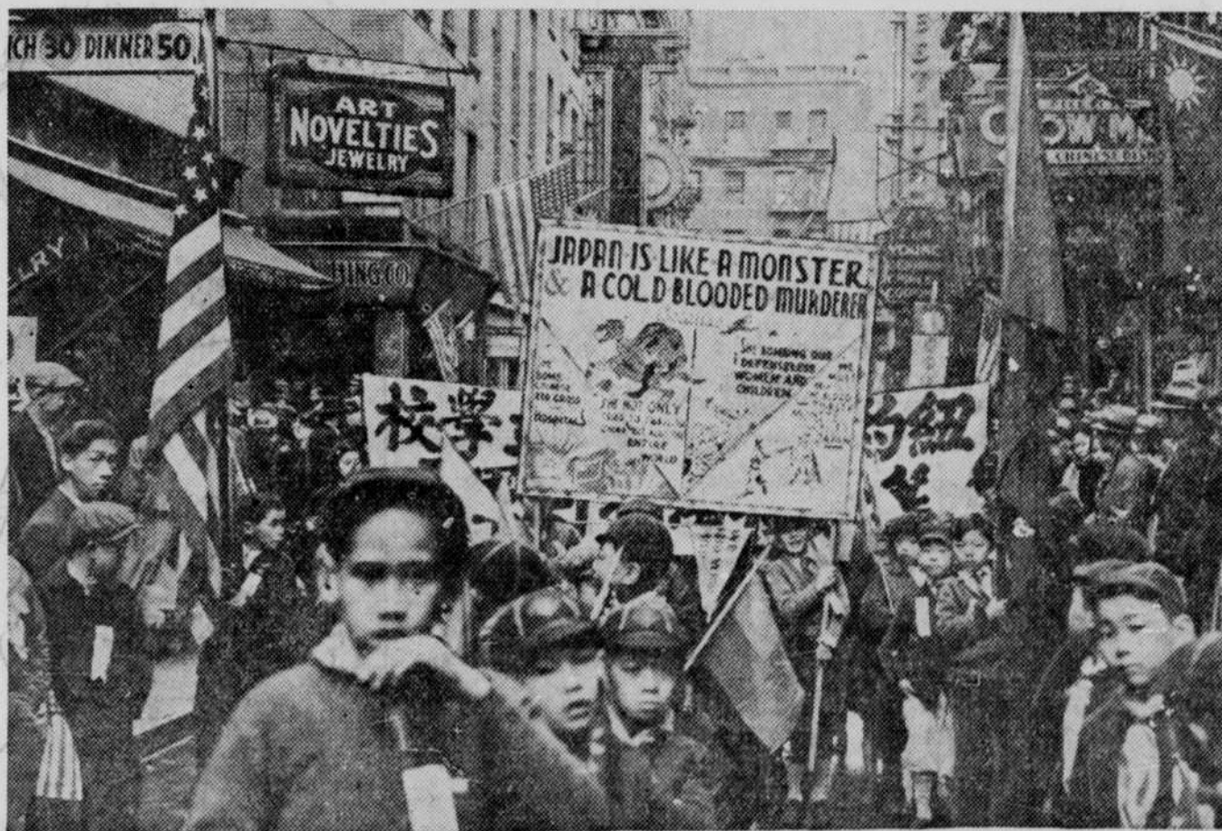
Chinese boy scouts marching along Mott street in an anti-Japanese demonstration in which the inhabitants of New York's Chinatown participated, in a drive for funds to aid war refugees. The boys are carrying a huge banner which relates: "Japan is like a monster and a cold-blooded murderer." Another rallying cry for donations was "Every penny kills a Jap."