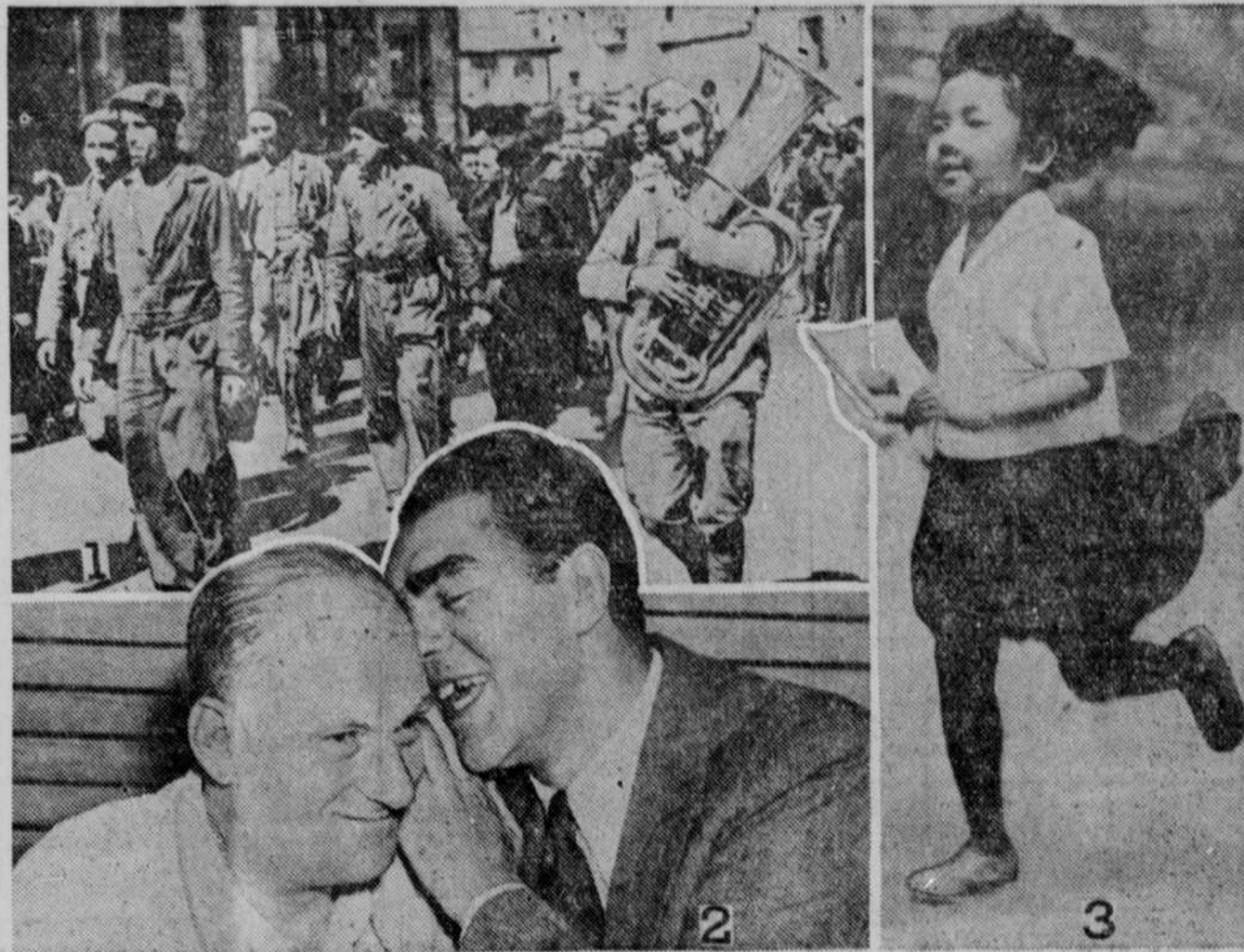
1—Insurgent troops, led by a single brass horn, triumphantly take over Santander, last important Spanish government post on northern coast. 2—Maybe Max Schmeling is whispering to Mike Jacobs, promoter, what he'll do to Joe Louis in the bout next June for which Mike signed him. 3—Out of breath, but not running from the Chinese is little Princess Yori-No-Miya, fourth daughter of the emperor and empress of Japan, seen in sports at a Tokyo school.