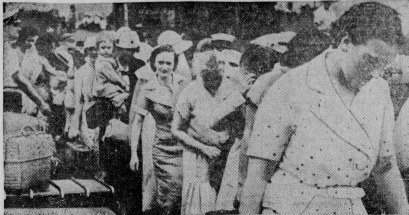
Shanghai.—Americans are fleeing Shanghai as Sino-Japanese war terrors mount. This is a scene on Shanghai customs jetty as 350 American women and children were about to board a tender to take them to the liner President Jefferson, Manila bound following evacuation orders.