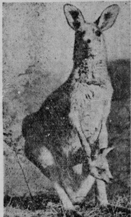
All the more reason for the novelty of this picture of the youngest hitch-hiker in the Paris zoo.

Paris.—It's not often that a cameraman has such luck in picturing a leaping marsupial of the gray kangaroo family with her youngster in its pouch.