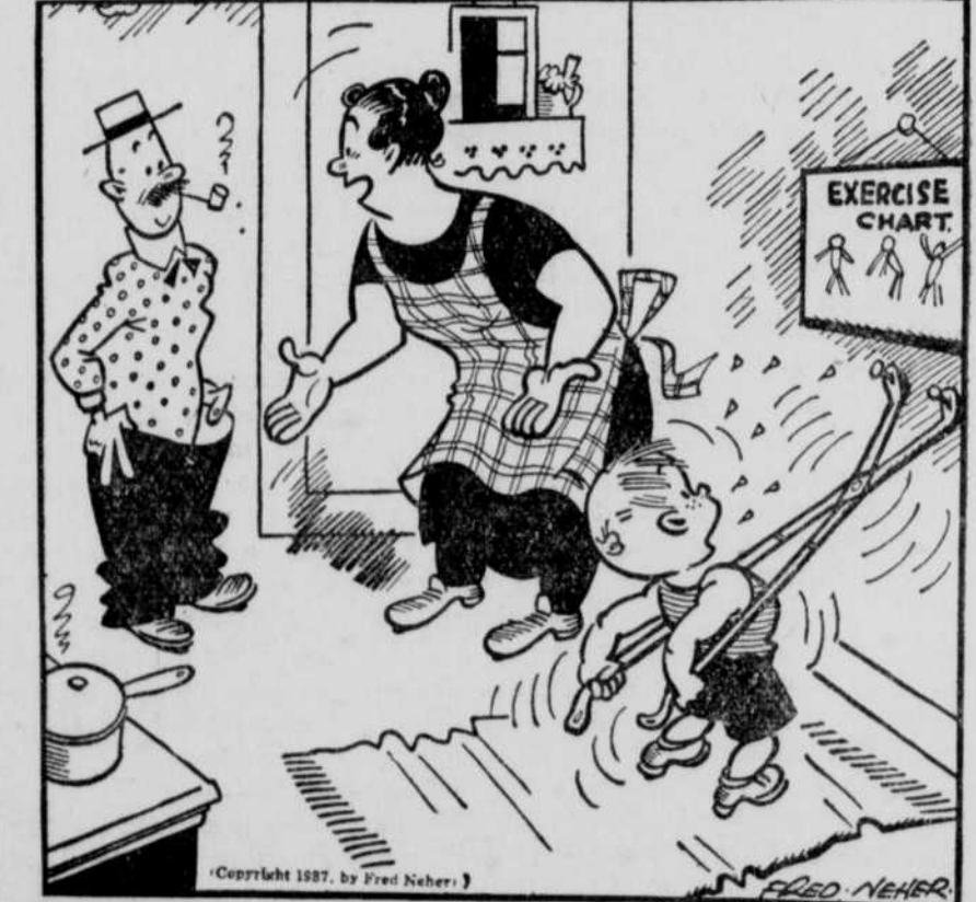
"What if you are a few minutes late to work . . Junior's got to finish his exercises!!"