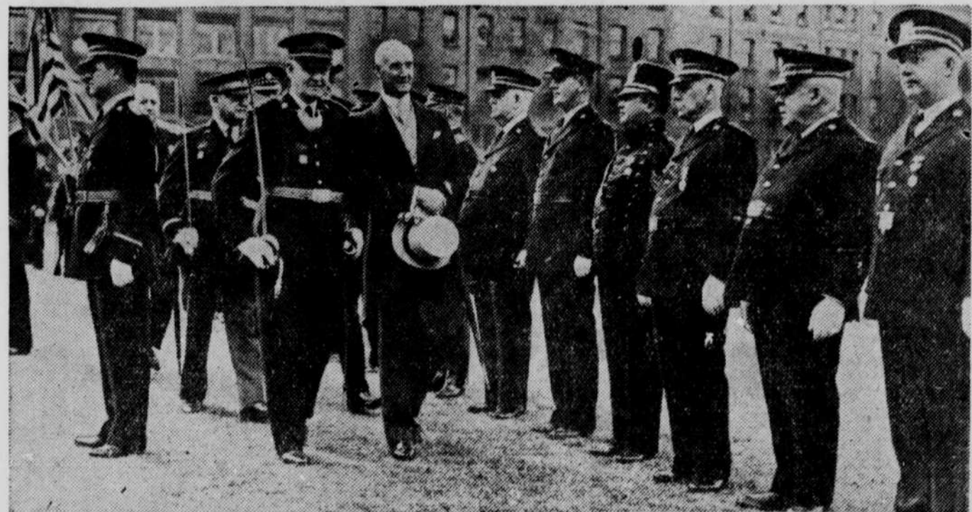
Sir George Broadbridge, the lord mayor of London, inspects the Ancient and Honorable Artillery Company of America during a garden party in honor of the British Honorable Artillery Company on the four hundredth anniversary of its founding recently. The British company is one of the most exclusive regiments in England. The American company dates from 1638 when a group of planters in America who had been members of the British company formed a similar regiment.