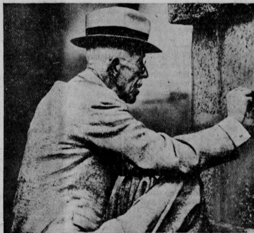
In tailorsque pose, King Gustav of Sweden is pictured seated on the ground as he autographed the memorial stone placed outside the Gothenburg water works during the recent celebration of its one hundred and fiftieth anniversary.