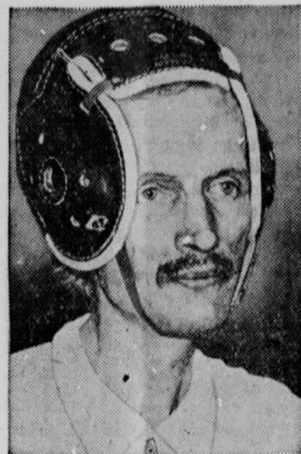
Dr. Jean Piccard, famed stratosphere scientist who miraculously escaped death when his "balloon cluster" craft crashed flaming to earth near Lansing, Iowa, after a takeoff from Rochester, Minn. He estimated he had reached 11,000 feet before starting his descent. The scientist was carried on his flight by a double cluster of 80 small balloons, one cluster above the other.