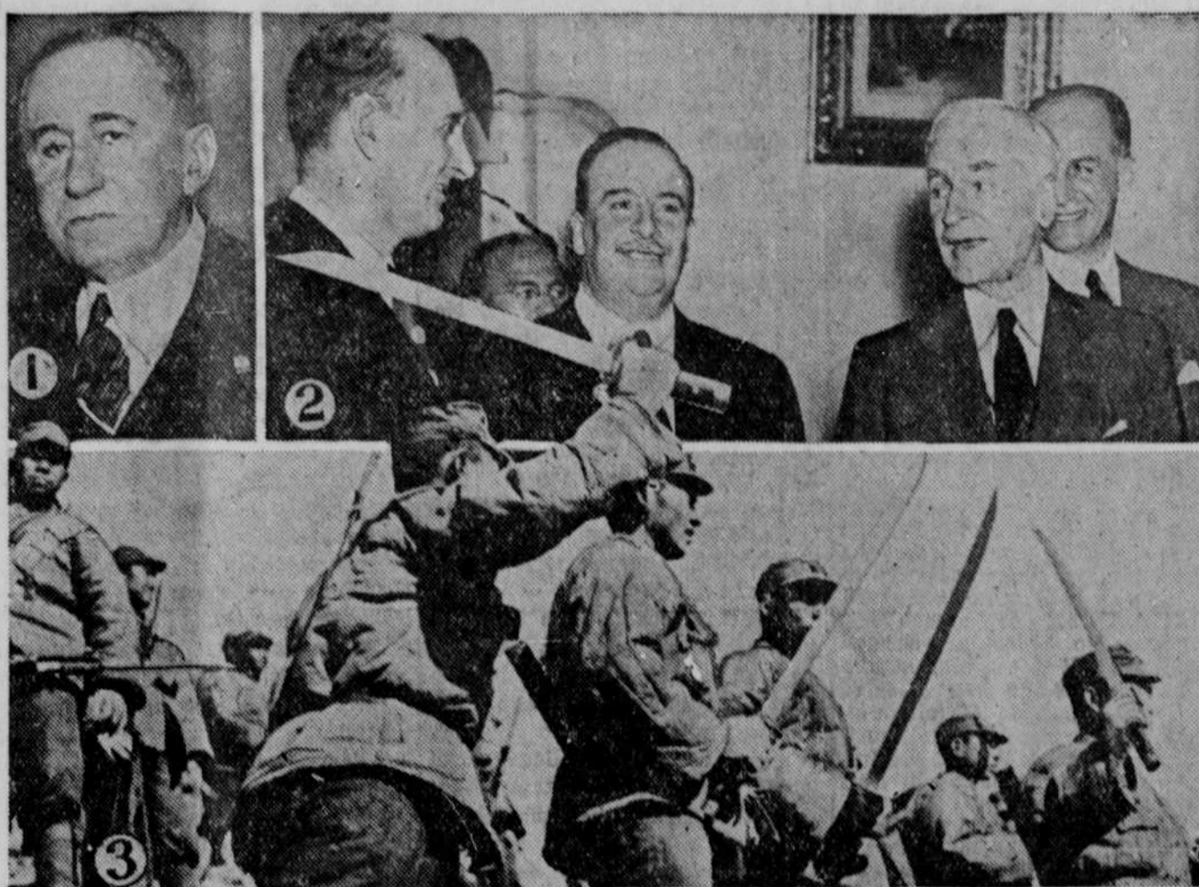
1—The late Guglielmo Marconi, father of radio, who was accorded a state funeral by Italy following his death recently. 2—Secretary of Treasury Henry Morgenthau (left) shown with Arthur DeSousa Costa (center), and Secretary of State Cordell Hull following a conference in which the United States agreed to sell $60,000,000 worth of gold to Brazil to aid the southern republic in bolstering its currency. 3—Chinese soldiers: typical of the troops now warring with Japanese soldiers in North China.