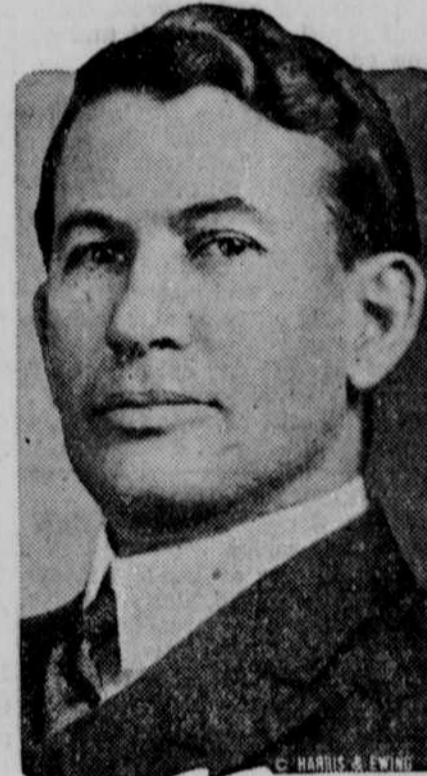
Senator Alben Barkley of Kentucky, who was elected majority leader of the senate to succeed the late Senator Joseph T. Robinson of Arkansas. He received 38 Democratic votes in a close contest with Senator Pat Harrison, who received 37.