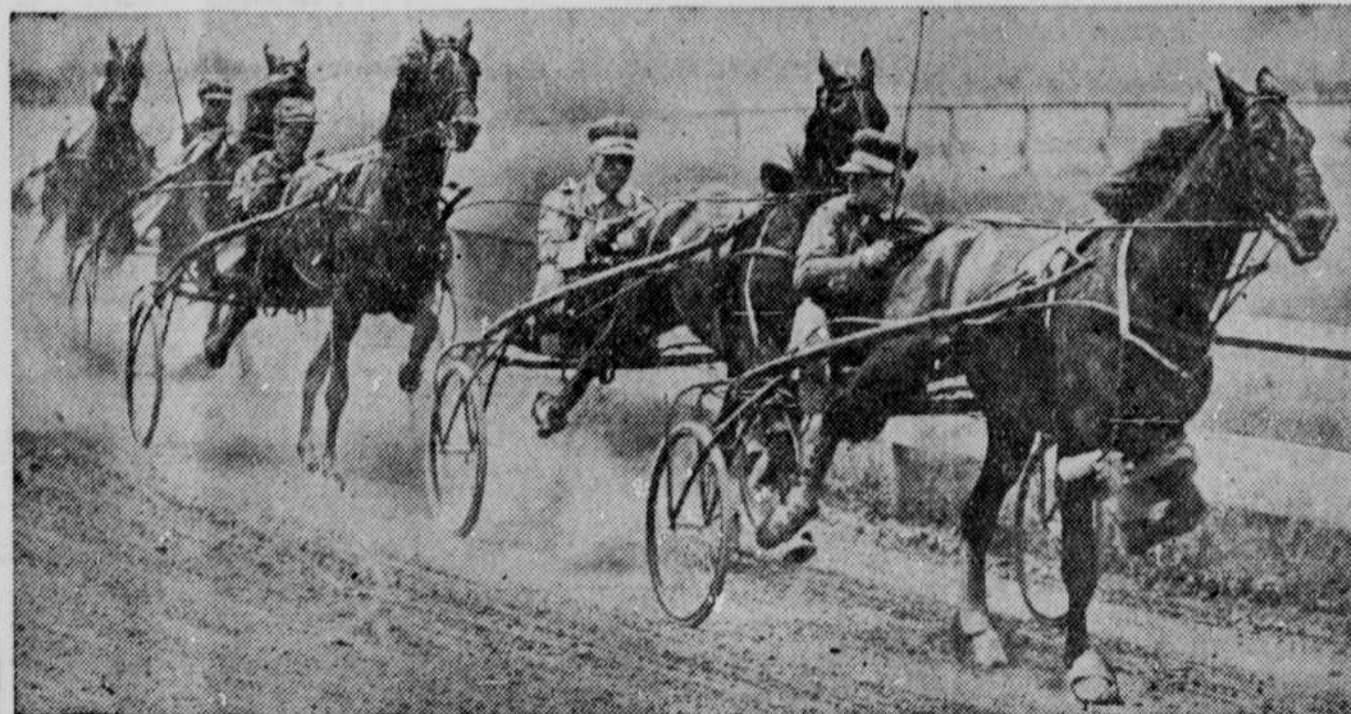
Field of trotters in the second heat of the Tuxedo Purse race at Goshen, N. Y., recently, shown rounding the turn with Freckles in the lead. Mr. Watts, however, got up a burst of speed to lead across the line. Freckles ran second and Gunkles third.