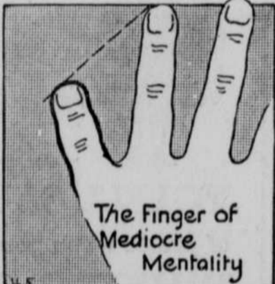
The Finger of Mediocre Mentality