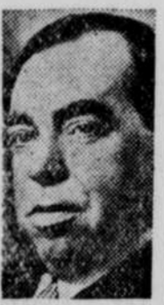
Irvin S. Cobb

And once I enjoyed a fire scare here when the alarm, at 3:30 a. m., brought to the lobby a swarm of moving picture actors without any make-up on and not much else. This was in the era of the silent films, but you wouldn't have dreamed it to hear the remarks of a hysterical lady star when she discovered that her chow had been forgotten. The current husband also was temporarily missing but she was comparatively calm about that. She probably figured a husband could be picked up almost any time whereas darling little Ming Poo had a long pedigree and represented quite a financial investment and anyhow was a permanent fixture in her life.