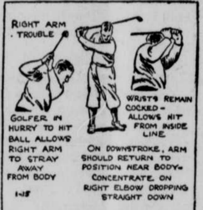
POSITION OF RIGHT ARM

KEEP your eye on the golfer who is overanxious to kill the ball and you no doubt will see him flap the right arm around so that at the top of the stroke it is almost straight out from the trunk of the body. From such a position it is very easy to make the mistake of coming onto the ball from the outside in, i.e., cutting across the ball and adding a slice. Furthermore such an extreme movement adds an unnecessary tension to this arm which it could very well do without. The proper method is to keep the right arm comfortably close to the right side. Tommy Armour for example keeps his right elbow tucked in close but possesses freedom of action nevertheless. Armour's is more or less of an extreme position, most of the players allow the right arm a trifle more freedom after the manner of Bobby Jones above. On the longer shots the Atlanta wizard's elbow is raised moderately and on the first stages of the downstroke, drops abruptly nearer the side. The cock of the wrists is in no manner disturbed by this motion and their power is saved to be utilized later on. The abrupt dropping of the right arm insures a swinging path from the inside, close to the body and brings the clubhead onto the ball straight along the line of flight.