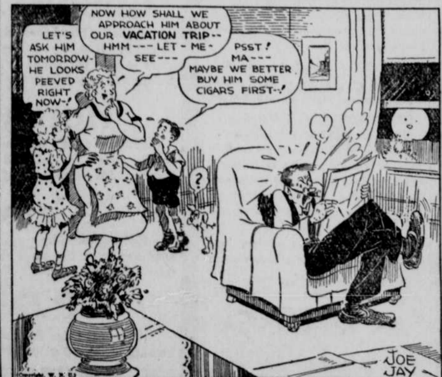
J. R. M. S.