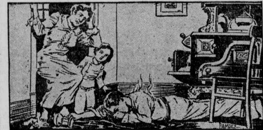
She Found Her Husband Lying Stiff and Still on the Floor.

John and the boy started for the stairs. As he did, he shouted back to Mrs. Sproul. "Get the other children," he cried, "and come down-