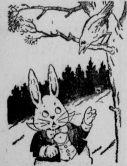
'Oh, Winsome, I'm So Glad You've Got Here at Last: I'm So Happy I Could Sing for Joy."

what he would do when he heard a | Winsome.' sound that caused him to suddenly then he heard it again. This time for me." he jumped straight up in the air and kicked his heels together for joy. It