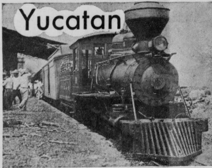
Wood-Burning Engine in Yucatan.

Prepared by National Geographic Society, Washington, D. C.—WNU Service.