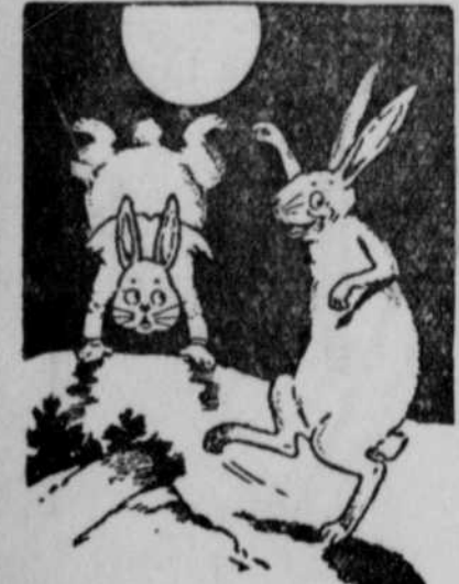
They Hopped and Skipped and Jumped and Did All Sorts of Foolish Things.

EVERYBODY said that Peter Rabbit and Jumper the Hare had gone crazy. Of course, it wasn't true. They weren't really crazy, even if they did act so. People always say that Jumper the Hare is mad at this time of the year, but it isn't so unless trying to show how happy and full of joy you feel is madness. That was the trouble with Jumper and Peter this time. They