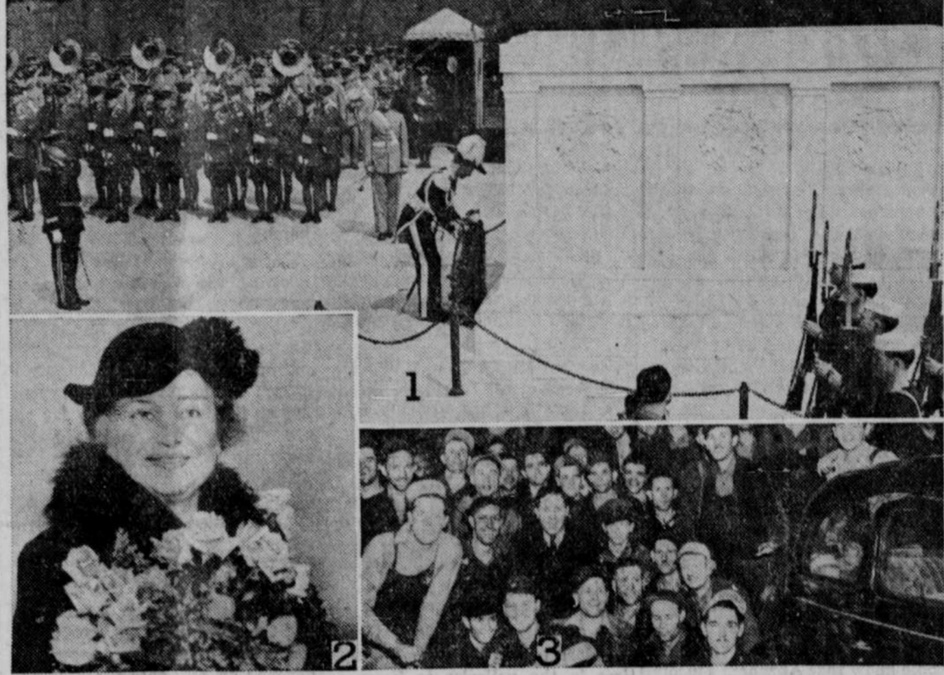
1—Lord Tweedsmuir, governor-general of Canada, shown putting a wreath on the tomb of America's Unknown Soldier on recent visit to Washington. 2—Helen Keller, who overcame blindness and deafness, as she embarks for the Orient on a lecture tour. 3—Sit-down strikers in Ford Kansas City plant, who returned to work following a brief demonstration.