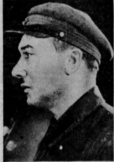
Genrikh G. Yagoda, former chief of the dreaded Russian OGPU (secret police), who is the latest celebrity accused of plotting against the life of Josef Stalin. Dismissed from his post of commissar of posts and telegraphs recently, he is reported now a captive in one of Moscow's grim prisons.