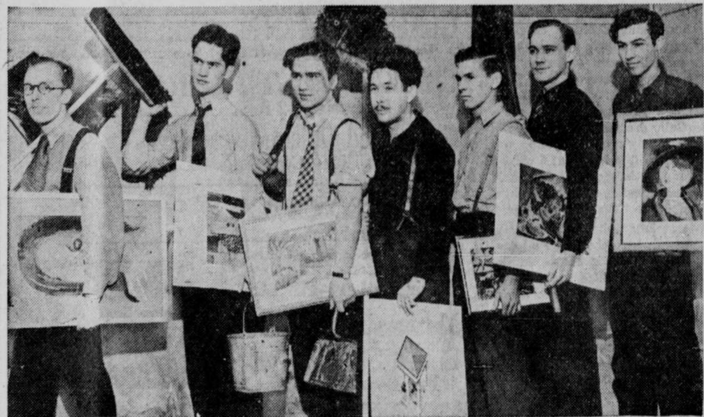
Paint all day and mop all night is the rigorous schedule these youths follow. They are students at the Chicago Art institute who work their way through art school by doing janitor work in the institute after classes. There are 25 of the students who seize mops and pails and clean up rooms and corridors after their day in class.