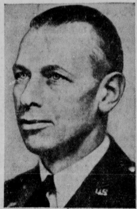
Lieut. Col. Charles W. Ryder, now on duty with the army general staff, who has been appointed commandant of cadets at the United States Military academy.