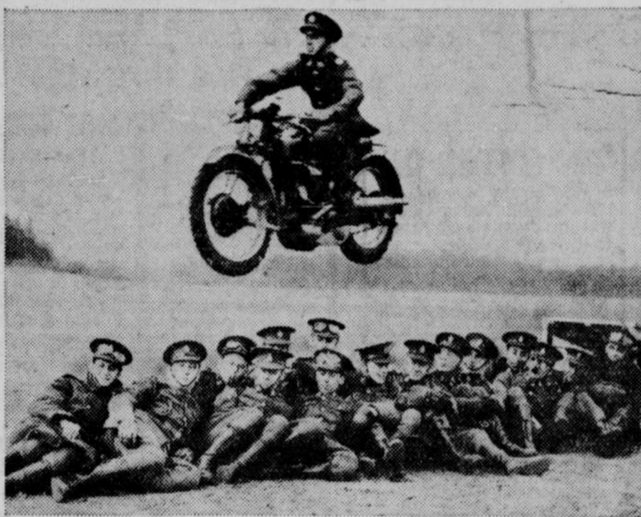
Imagine the feelings of the man at the end of this recumbent line of members of the Royal Signal corps if the trick motorcyclist underestimates the length of the jump. It's the end man that's ridden over roughshod. Everything turned out all right, however, in this test made near London.