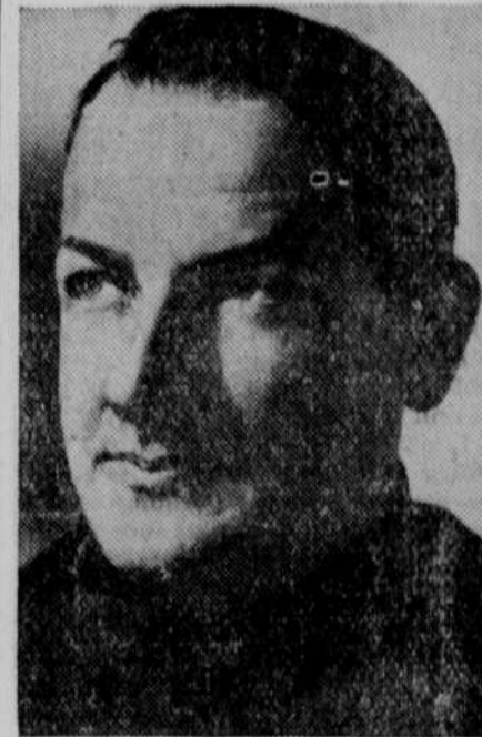
A recent photograph of Vice Premier Valery Ivanovitch Mezhlauk, who has been appointed to the post of commissar of heavy industry of the U. S. S. R. to succeed Gregory K. Ordjonikidze, who died recently. Mezhlauk is well known in the United States, having traveled extensively about industrial centers here.