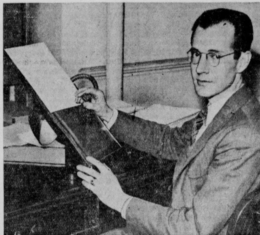
Dr. Fred L. Whipple, of the Harvard observatory, who announced recently the discovery of a new small comet in the constellation Canes Venatici (the hunting dogs), is shown in his office at Harvard university, checking over negatives made at night of the stars. The comet, which has a tail about "one degree long" and is of the twelfth magnitude, was discovered by the astronomer when he examined a photographic plate he had taken.