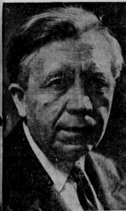
A new distinction for variously distinguished Vilhjalmur Stefansson, world famous American explorer, scholar and author, was his recent election as president of the Explorers' club, New York. Renowned for his many expeditionary studies of Arctic archeology, anthropology, ethnology and geography during the past quarter-century, Stefansson holds degrees, medals and other high honors.