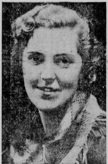
Miss Prunella Stack, twenty-two-year-old leader of the Women's League for Health and Beauty, of London, who has been invited by Prime Minister Stanley Baldwin to serve on the national advisory council which will draw up plans for the national college of physical training.