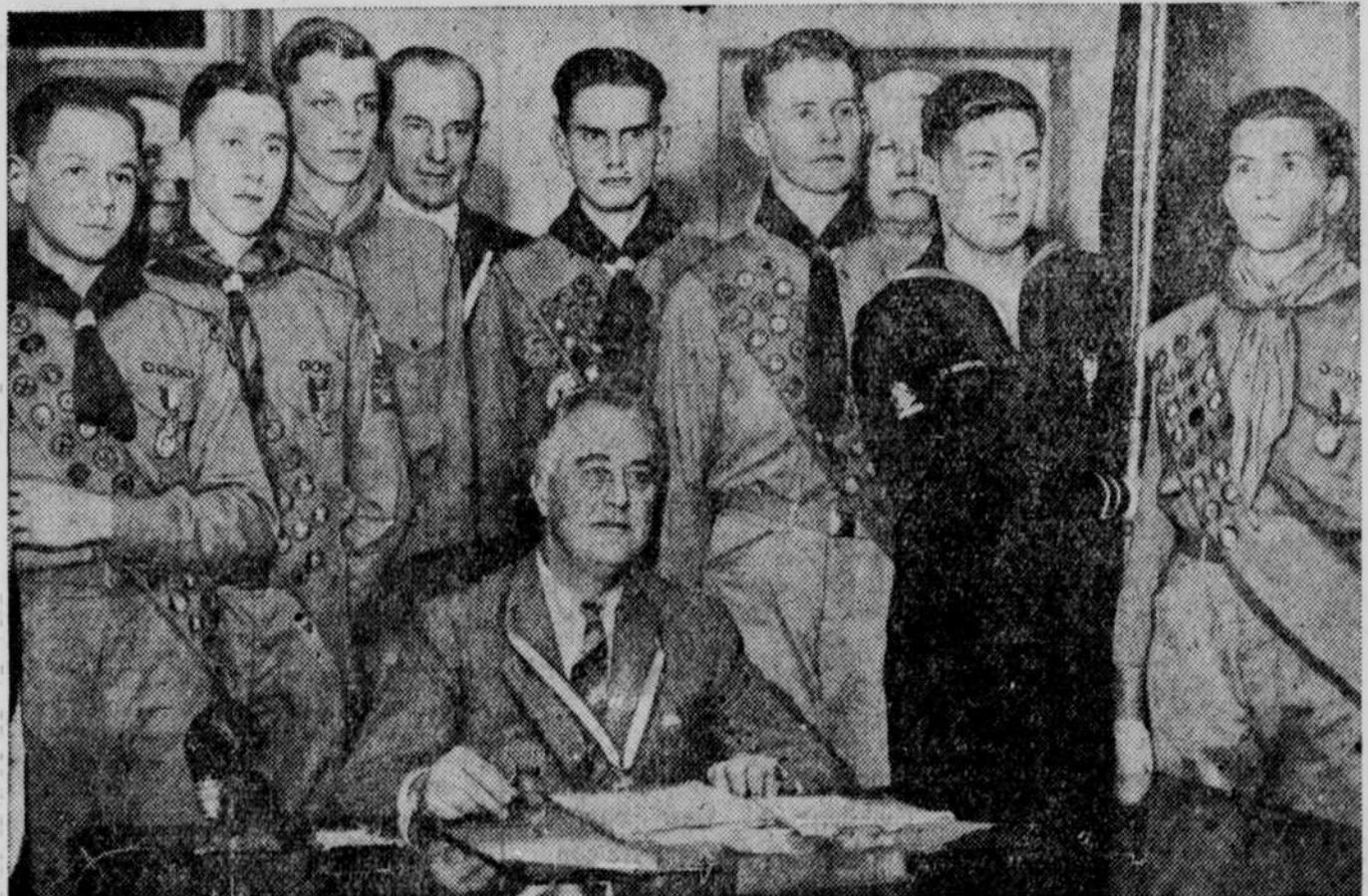
Surrounded by Eagle Boy Scouts, President Franklin D. Roosevelt broadcasts a message to a million Scouts as the twenty-eighth year of the U. S. scout movement opens. By virtue of his office, the President is honorary president of the national scout organization. He has been an active leader in scouting for 15 years.