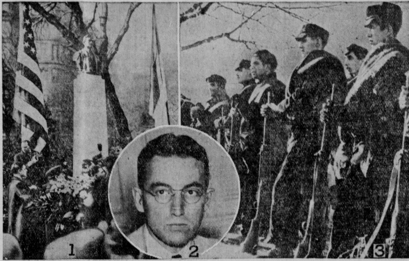
1—French officialdom assembles at ceremonies in which a bust of the late Myron T. Herrick, American ambassador to France, is unveiled. 2—Arthur J. Altmeyer, recently appointed chairman of the social security board to succeed John G. Winant. 3—Battalion of the famous International brigade credited with saving Madrid from assaults of the rebels.