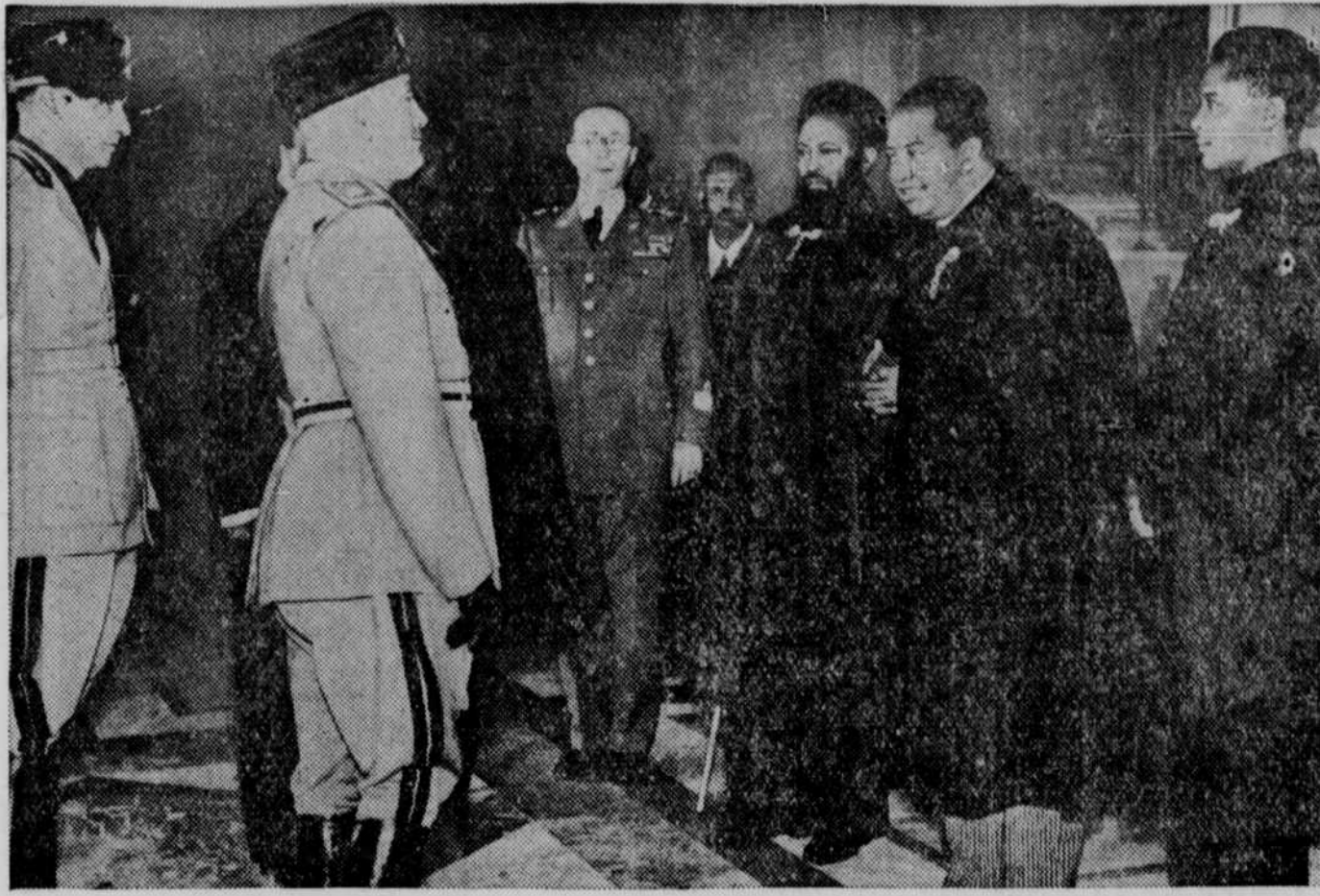
Ras Seyoum, fiercest of the Ethiopian warrior chieftains during the recent Italo-Ethiopian war, is graciously received in Rome, by Premier Benito Mussolini. The dignified, bearded chief is now a peaceful friend of Italy, offering good advice, unofficially, from his Addis Ababa home.