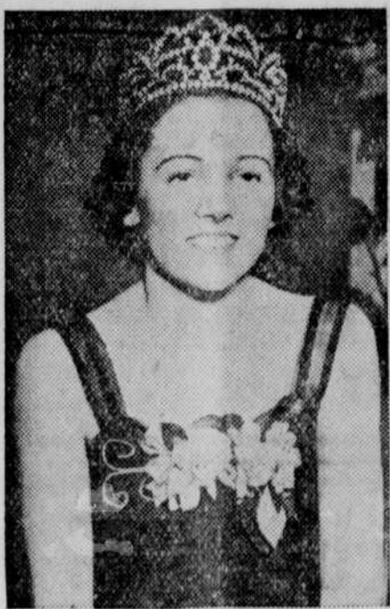
a charity ball at Northwestern university, Evanston, Ill., recently. Collegiate beauties from every university in the Big Ten except Michigan competed in the marathon.