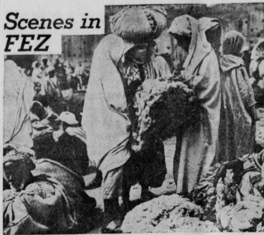
Dickering for Wool in a Fez Market.