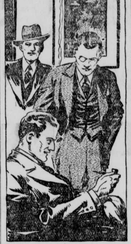
He Sank Limply Into a Chair.

view with marked distaste—"but it occurred to me to ask you if you have any ideas that might be helpful to us in solving Swift's murder." Hammie coughed impressively and appeared to give the matter considerable thought. "No, I have none," he at length admitted. "None whatever. But of course one can never tell about these things." "Of course," Vance agreed. "But I thought there might be something in the relationships of the various people here this afternoon." "All I can say," returned Hammie carefully weighing his words, "is that there were many warring elements in the gathering—that is to say, many peculiar combinations. There was a combination of this and that, which might lead to—well, to anything." "To murder, for instance?" Hammie frowned. "Now, murder is a very, very serious business. But, Mr. Vance, you can take it from me, in all solemnity, I wouldn't put even murder past any one of those present today. No, by Gad!" "That's an amazing indictment," muttered Vance; "but I'm glad to have your opinion and we'll consider it. . . . By the by, didn't you notice anything irregular in Garden's placing Swift's large bet on Equanimity at the last minute?" Hammie's countenance went quickly blank. Then, unable to withstand the direct scrutiny of Vance's