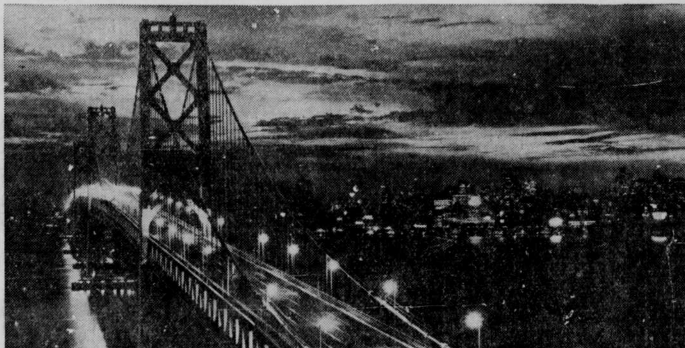
The world's largest sodium lighting installation, the first completed section of the Golden Gate bridge to Oakland, looking toward San Francisco from Yerba Buena island. Nine hundred and twenty-four sodium lights, the equivalent of 35 full moons makes the highway so bright that car headlights are unnecessary.