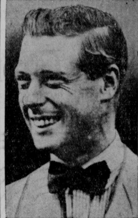
Former King Edward VIII of England who abdicated his throne that he might marry Mrs. Wallis Warfield Simpson, former Baltimore beauty. Edward was succeeded by his brother the Duke of York.