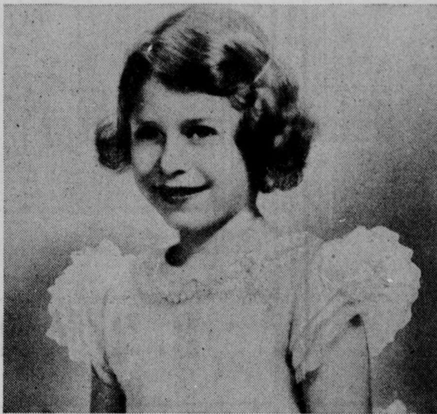
Recent photograph of Princess Elizabeth, ten-year-old daughter of King George VI and Queen Elizabeth of England. With the ascent of her father to the throne on the recent abdication of King Edward VIII she is next in line. Should she eventually ascend the throne, she will wear the crown last worn by Queen Victoria.