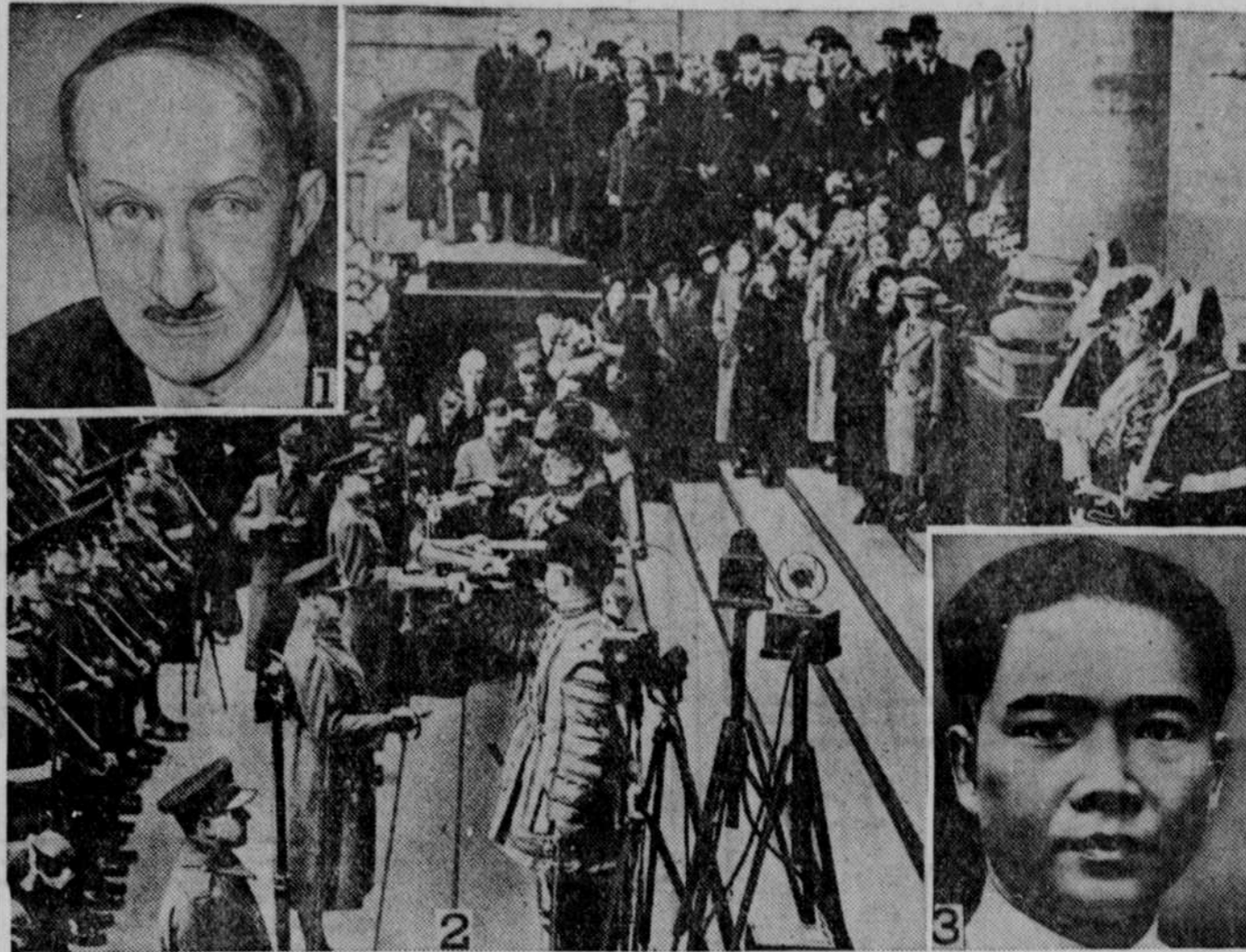
1—Georges Bonnet, former minister of finance, now slated to become French ambassador to the United States. 2—Ceremonies in London at which the Duke of York was officially proclaimed King George VI of England. 3—Generalissimo Chiang Kai-shek of China who was recently kidnaped by rival war lords.