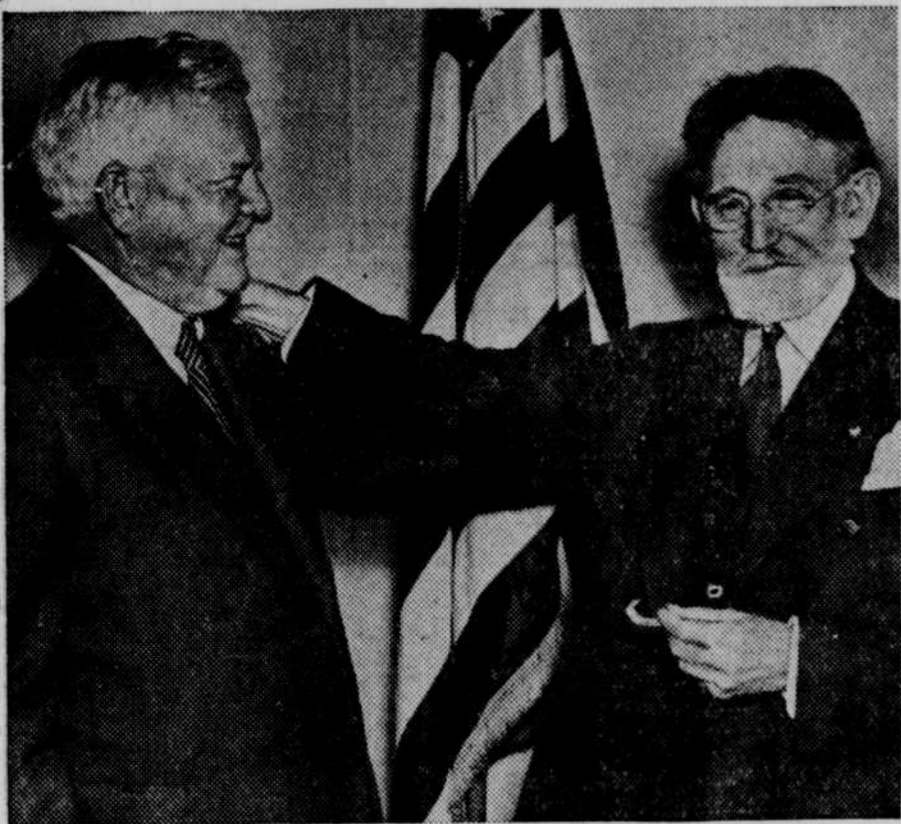
Vice President John N. Garner and U. S. Senator James Hamilton Lewis of Illinois, whip of the senate, are seen conferring over plans for the opening of the new Seventy-fifth congress.