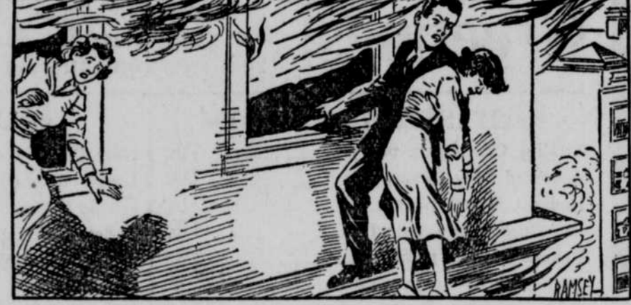
Holding the Girl, He Stood on a Narrow Ledge.

They Were Jumping to Death. Milt saw one of the girl stenographers escape through the window. Another one followed her. It was Milt's first day in the office. He thought there must be a fire escape down which the girls were fleeing. The porter