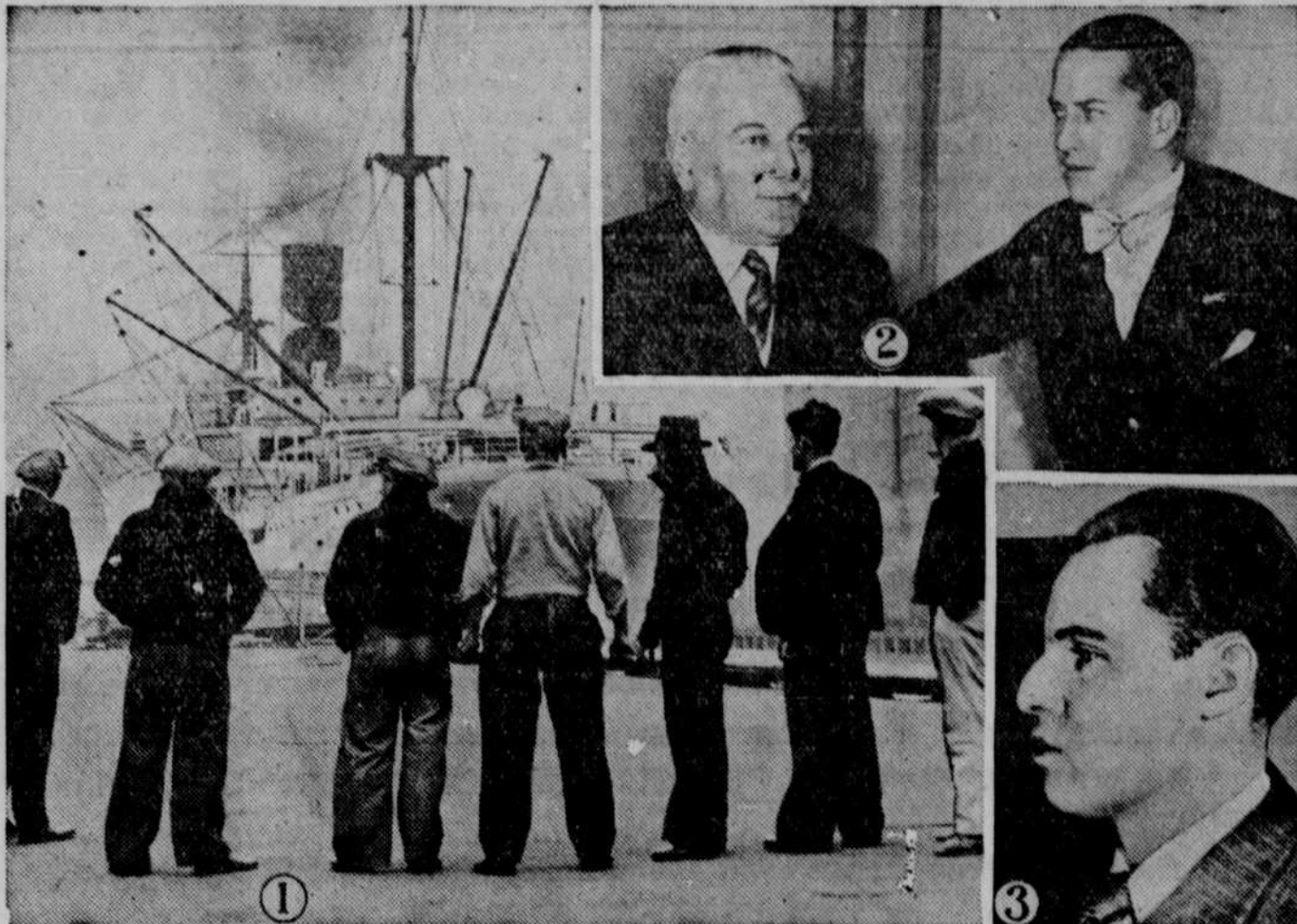
1—Picketers watching a freighter at San Francisco docks during the maritime strike which tied up the nation's shipping. 2—Baron Von Neurath, German foreign minister (left), shown conferring with Count Ciano of Italy during his recent visit to Berlin. 3—Leon Degrelle, so-called "Hitler" of Belgium, who was recently imprisoned, following the failure of a Fascist "putsch."