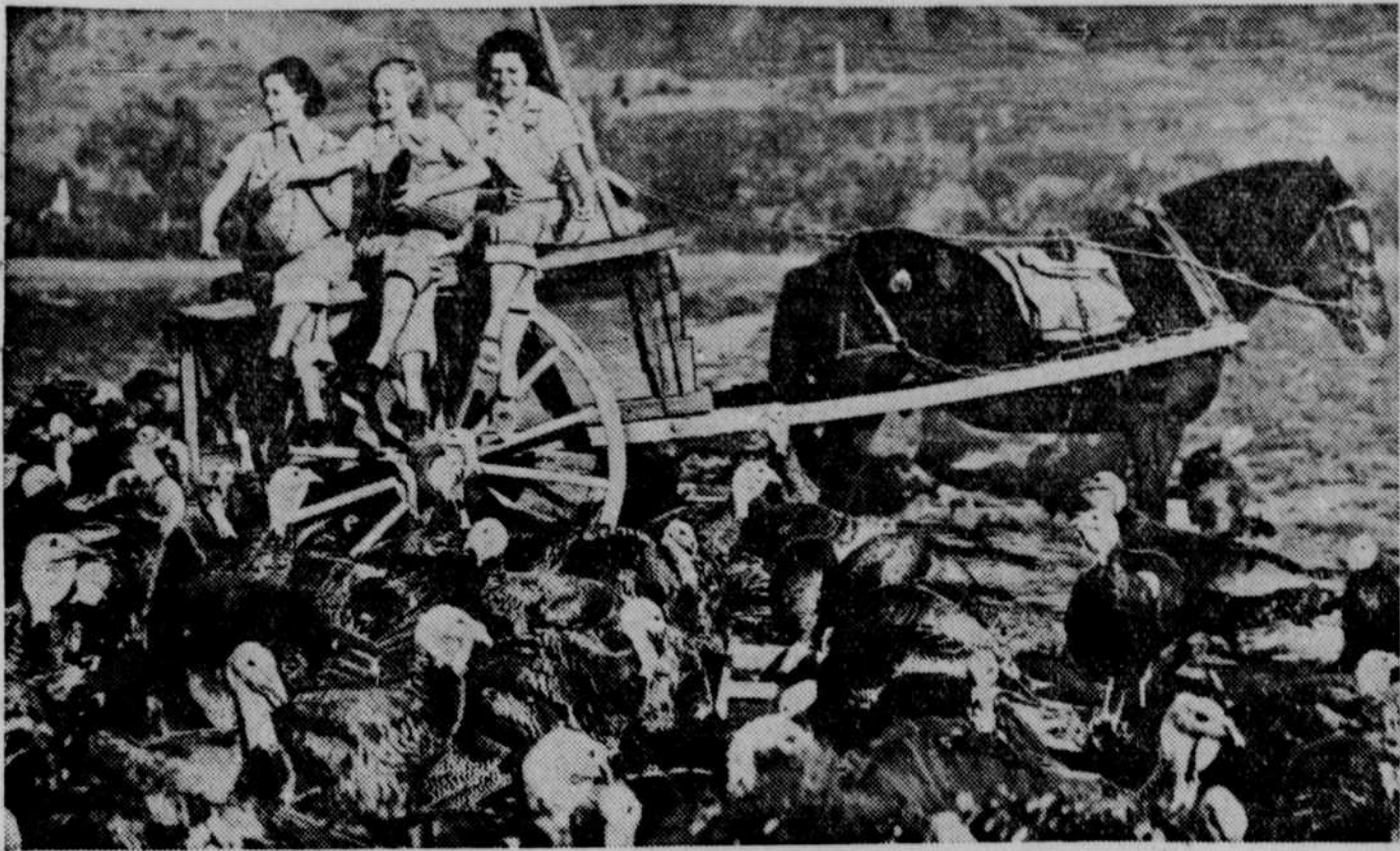
A million turkeys are being fattened by the Northwestern Turkey Growers in Utah who supply a great percentage of America's holiday birds. At this time each year, pretty Utah ranchettes help to feed and round up the choice birds which will soon grace Thanksgiving tables. Fair trio are seen feeding turkeys from the water wagon on a large Utah turkey ranch.