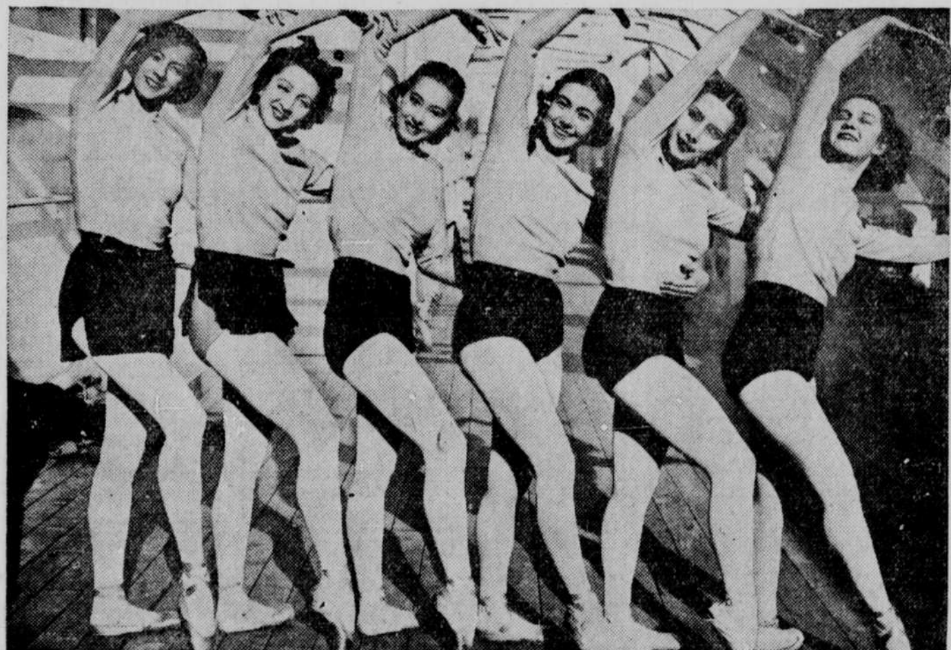
A group of French ballet dancers pictured aboard the S. S. Ile de France on their arrival in New York. They formed an unusual treat for the eyes of ship news photographers.