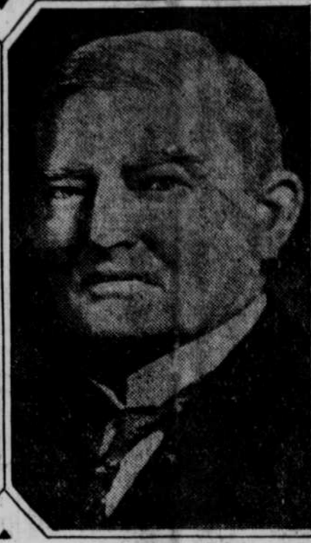
JOHN N. GARNER