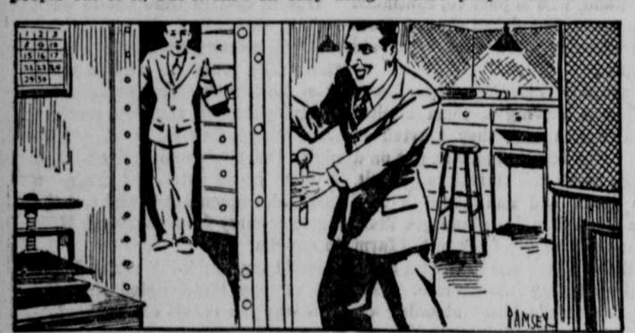
"Hurry Up, Charley, Or I'll Lock You In."

While crew after crew arrived on the scene the firemen worked frantically, but their labors were futile. A bank vault is built to keep people out of it, but it isn't an easy thing to GET people out of. And