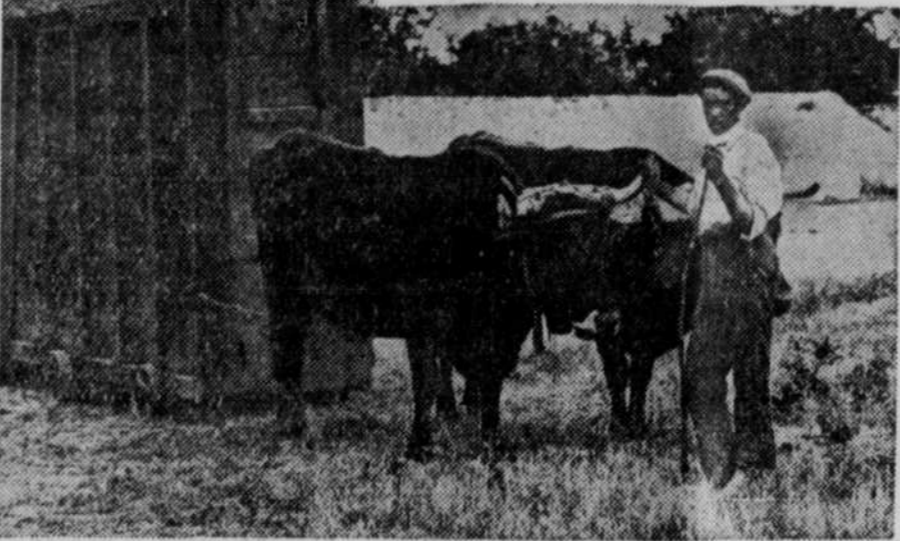
Docile Cows Haul Bulls to Spanish Arenas.

Prepared by National Geographic Society, Washington, D. C.—WNU Service.