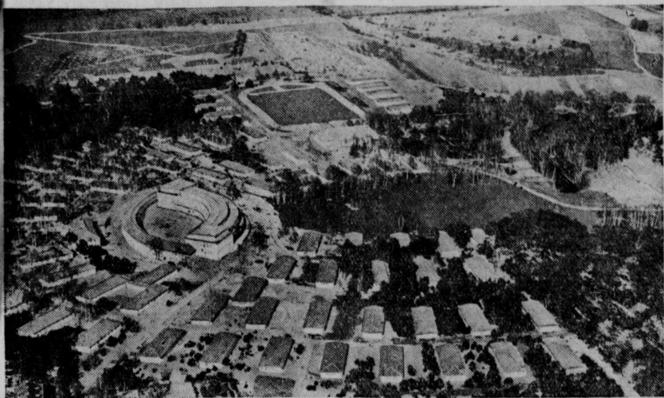
An aerial view of the Olympic village which has been completed on Berlin's outskirts, where the athletes from all over the world will be housed during the forthcoming Olympic games.