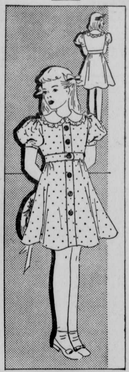
Pattern No. 1882-B

The time for gay little cotton prints both for older sister and the younger set is at hand, and nothing could be simpler than this darling dress—so easy to make—so comfortable for nimble dears—and so smart to wear. The French bodice effect and buttoned panel are cunning details which all little maidens love, especially the flared skirt, because it provides ample freedom for playtime. Decorative features are hidden in the contrasting collar trimmed with ruffled edging, and brief puff sleeves. The material may be a printed percale, lawn linen or gingham. If it is