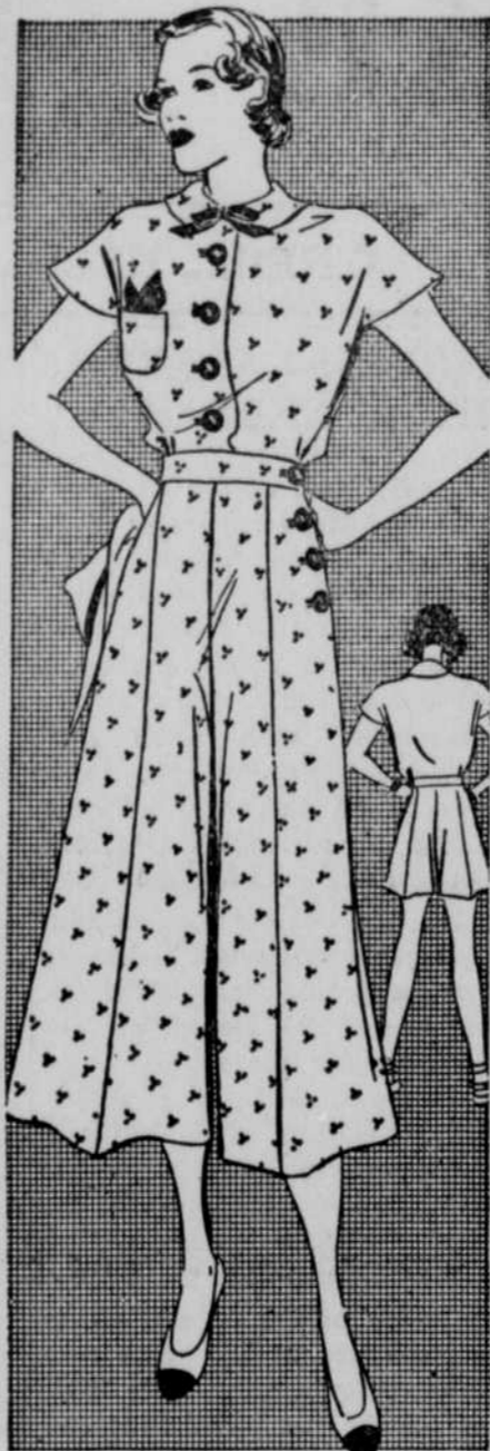
PATTERN NO. 1875-B