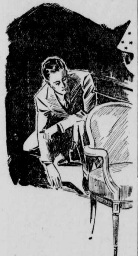
My Pistol on the Carpet Before Me.

An instant later I was crouching beneath the archway, with my pis-