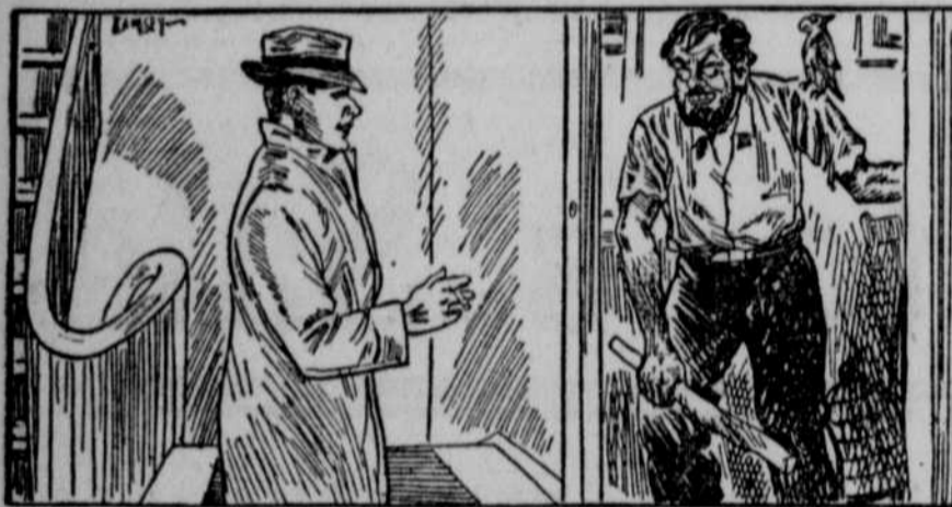
The Man Invited Charley to Enter.

Charley rang the bell. A tall, stout man opened it. He was in his shirt sleeves and on his left shoulder was perched a parrot. He had a