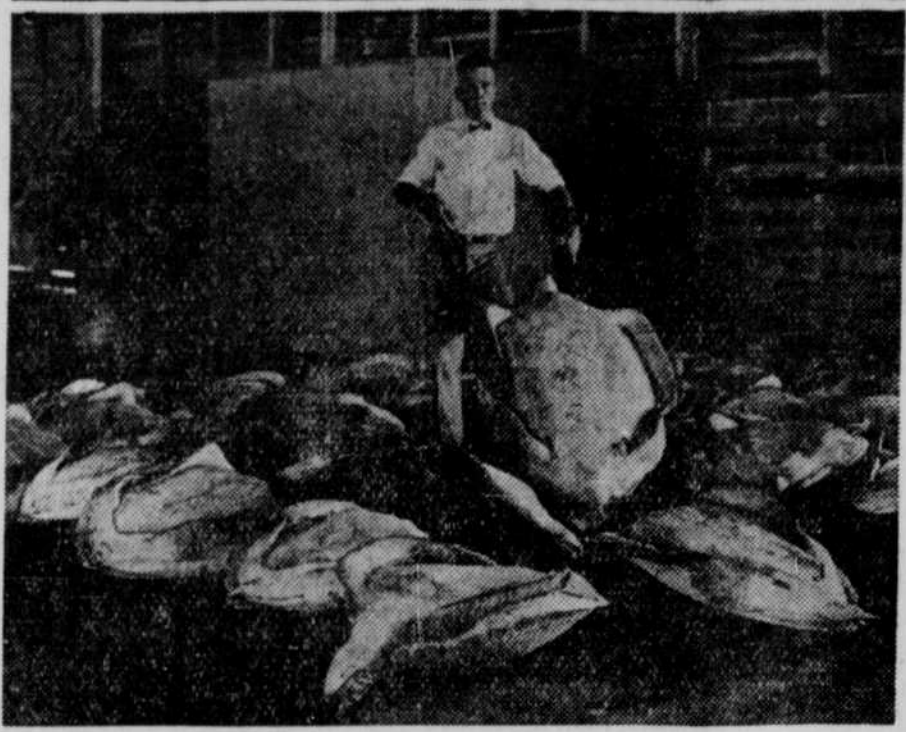
Potential Turtle Soup From Florida.

Prepared by National Geographic Society, Washington, D. C.—WNU Service.