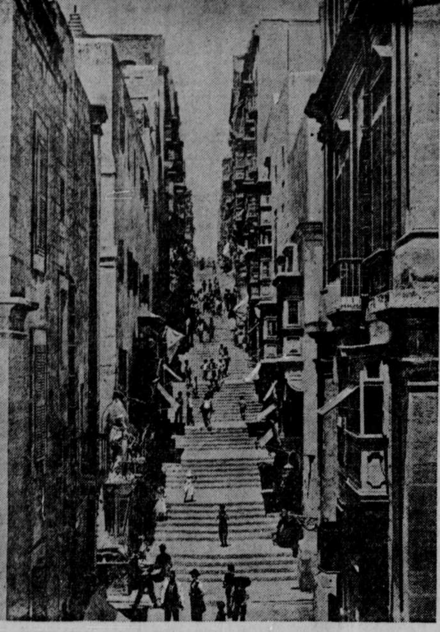
A Street in Valetta.

IBRALTAR, western gateway to the Mediterranean, and Malta, the mid-Mediterranean sentinel, both British-owned, have been brought into the news spotlight because of the Italo-Ethiopian political situation.