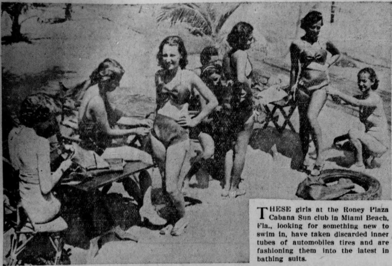
THESE girls at the Roney Plaza Cabana Sun club in Miami Beach, Fla., looking for something new to swim in, have taken discarded inner tubes of automobiles tires and are fashioning them into the latest in bathing suits.