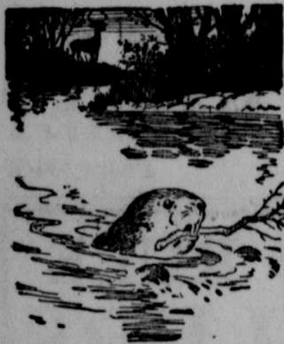
It was Paddy the Beaver Taking the Branch to His Woodpile.

DEEP in the Green Forest is the pond where lives Paddy the Beaver. It is Paddy's own pond, for he made it himself. He made it by building a dam across the Laughing Brook. When Lightfoot the Deer bounded away through the Green Forest after watching the hunter pass through the hollow below him, he remembered Paddy's pond. "That's where I'll go," thought Lightfoot. "It is such a lonesome part of the Green Forest that I do not believe that hunter will come there. I'll run