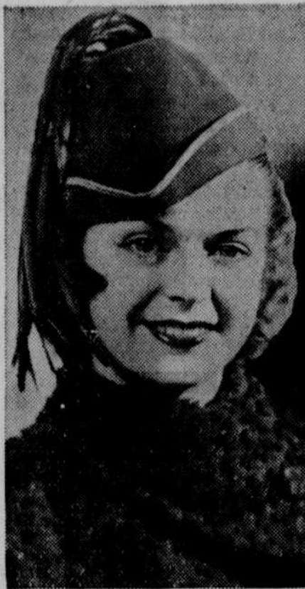
Coq feathers cascade in military fashion from the top of this olive green felt toque. The rolled brim is bound with gold silk braid.