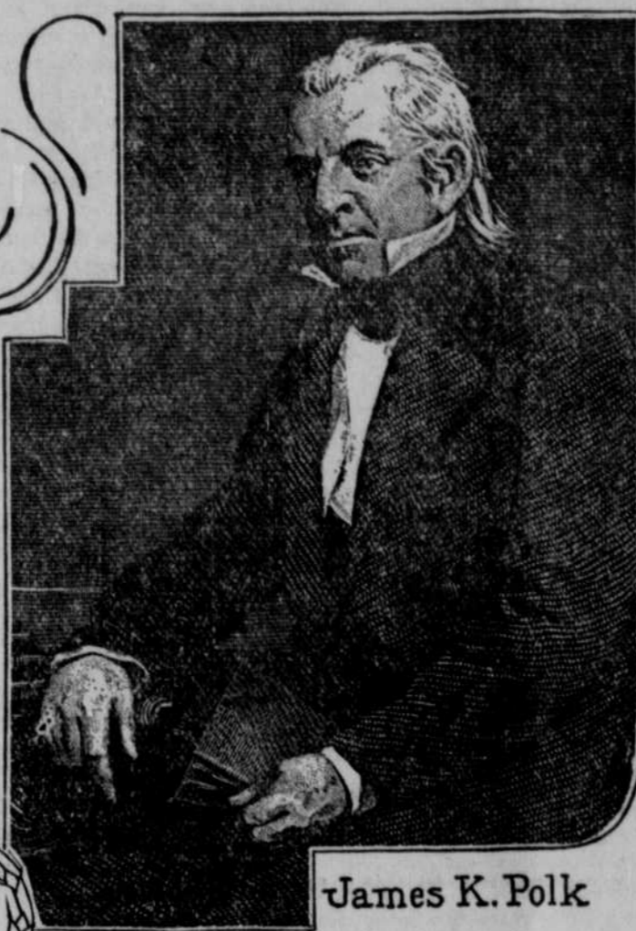
James K. Polk