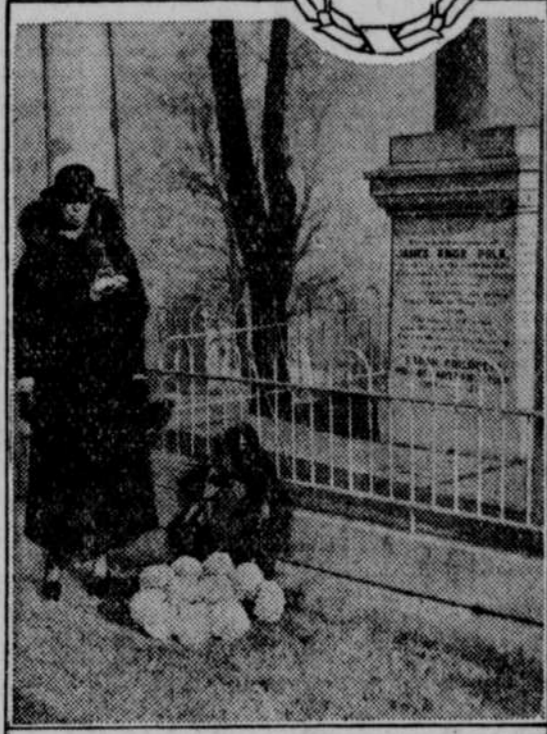
A Tribute from "The First Lady of the Land"

When the Democratic convention met in Baltimore it was apparent that Van Buren would have a majority of the delegates. And then the second