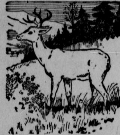
Lightfoot Listened and Watched.

In the case of Buster Bear and Danny, the latter had simply to keep out of reach of Buster. As long as Buster didn't get his great paws on Danny the latter was safe. Then, too, Danny is a very small person. He is so small that he can hide under two or three leaves. Wherever he is he is pretty sure to find a hiding place of some sort. His small size gives him advantages in a game of hide and seek. It cer-