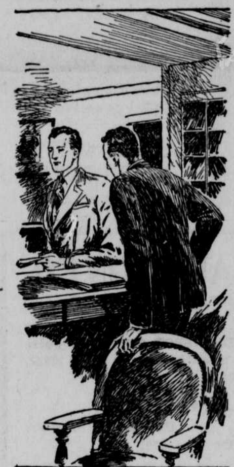
As If He Had Expected It, He Pushed the Paper Into His Pocket.

And he held her before him by the arms and looked into the living blue of her eyes-deeply strengthened against him, yet never blind to the wonder of what had occurred