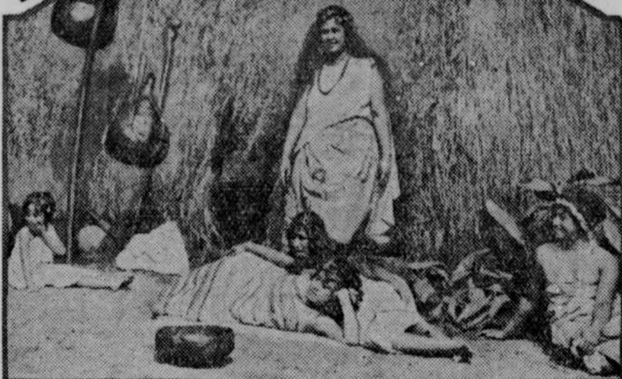
The Ideal Life in Halawa.

TRAVELER, novelist, naturalist, poet and philosopher have dreamed consistently of a "lost land." They haven't wanted to find it because it would then no longer be "lost." They merely wanted proof of its existence. There would be the setting for flights of fiction and fancy. There would be the locale of romance supreme and undiluted by fact. It would be peopled by the fabled "lost tribe." It may be the valley of Halawa, on the island of Molokai, right within the boundaries of the United States. Few have ever seen it but it is known to be there, a walled Paradise, almost as virgin in primitive peace and plenty as if it were the Garden of Eden rediscovered. What is known as civilization has not yet dawned there. Steps have been taken to prevent it from dawning. Even the birds have not learned the almost universal lesson of animate life—that the struggle for the existence leads to natural enmity, pitting one species and one tribe in a conflict against another.