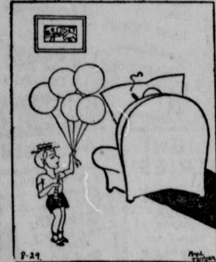
"Pop, what is pedigree?" "Blue streak."