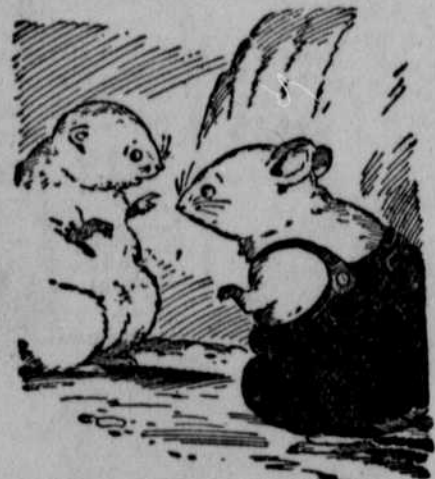
"What Was a Crazy Thing to Do?" Demanded Danny, Looking Puzzled.

SITTING safe and comfortable in the hollow stump to which Whitefoot the Woodmouse had led him, Danny Meadow Mouse told Whitefoot all about his adventures from the time he had visited the Smiling Pool right up to the mo-